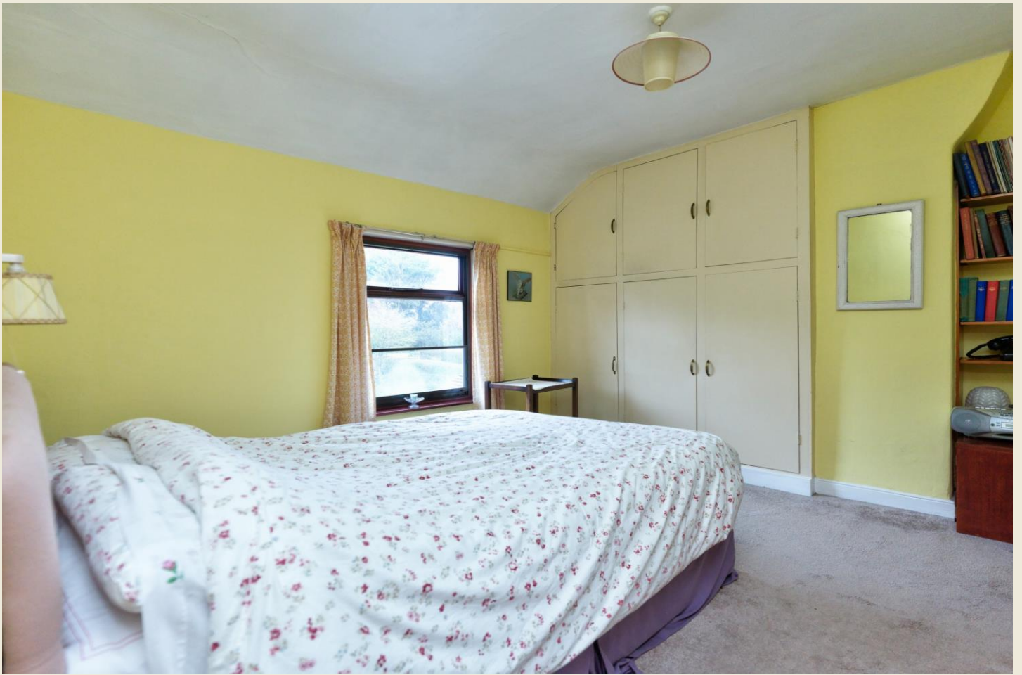
BEDROOM TWO (11'10 x 11'2)