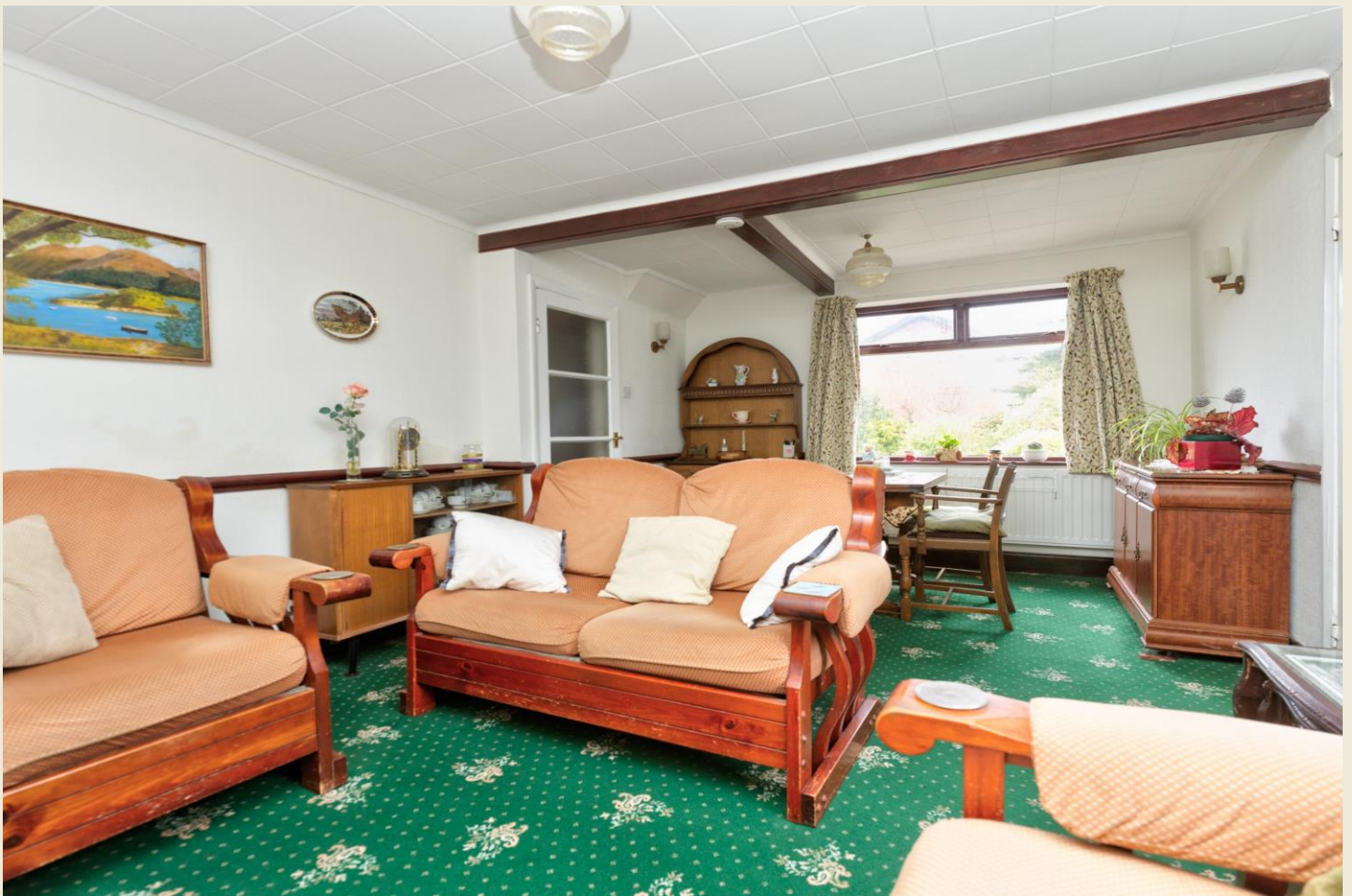
DINING SITTING ROOM (18'4 x 11'2 max)