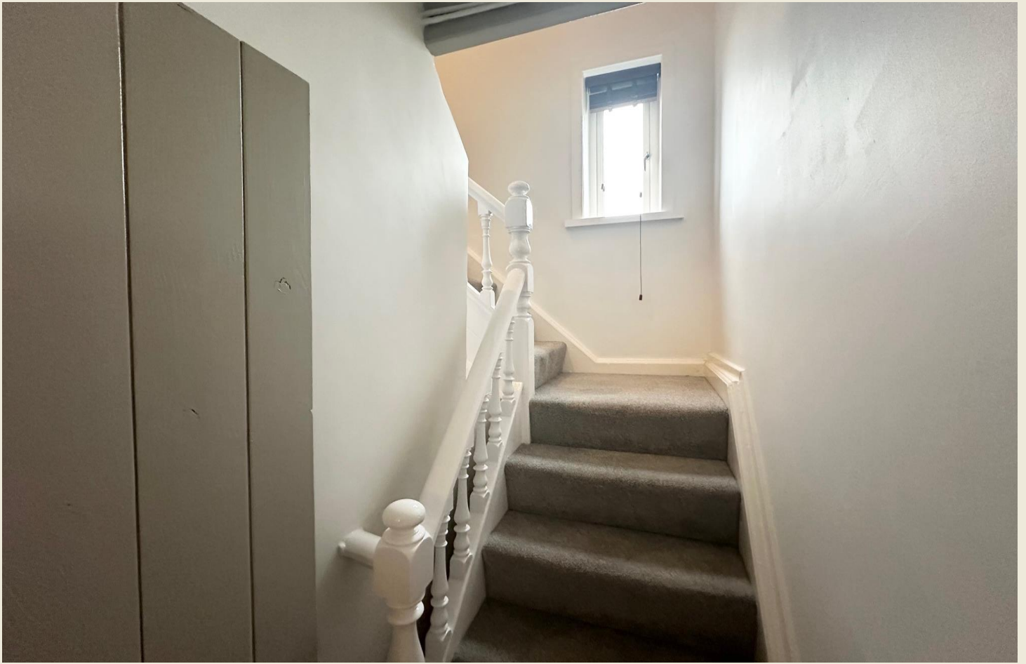
STAIR WELL RISING TO THE FIRST FLOOR:-