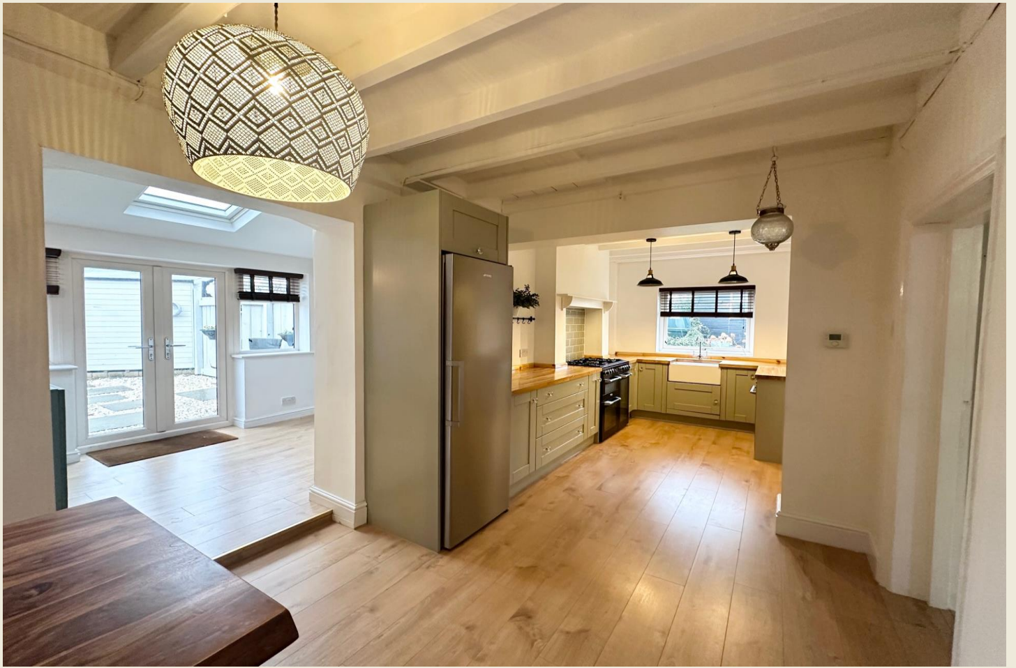
KITCHEN DINING ROOM (24'7 x 8'6)