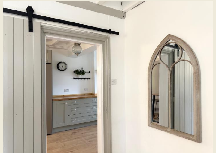
FRONT ENTRANCE PORCH (OFFICE)