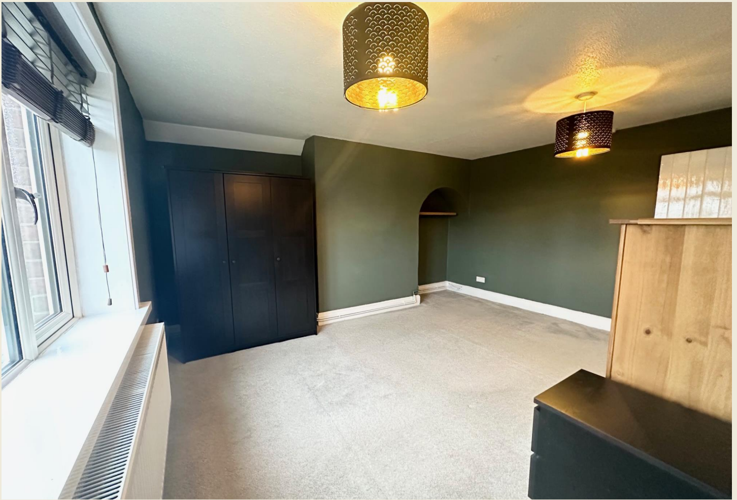
BEDROOM ONE (13'1 x 10'10)