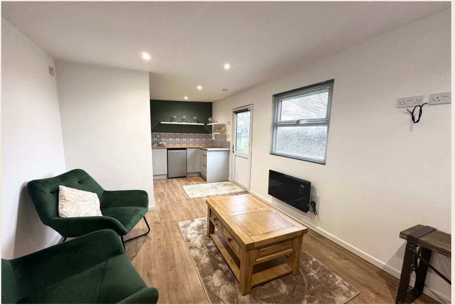
DETACHED STUDIO / OFFICE / LEISURE ROOM (19'8 x 9'10)