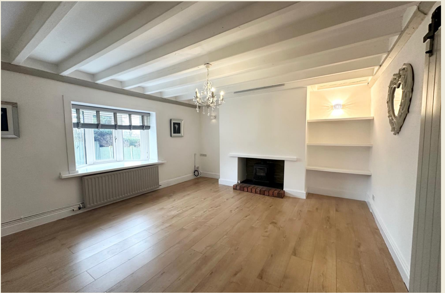
LIVING ROOM (15'1" x 13'1")