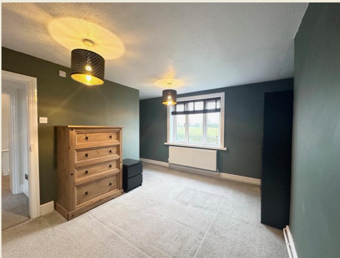
BEDROOM TWO (11'9 x 8'6)