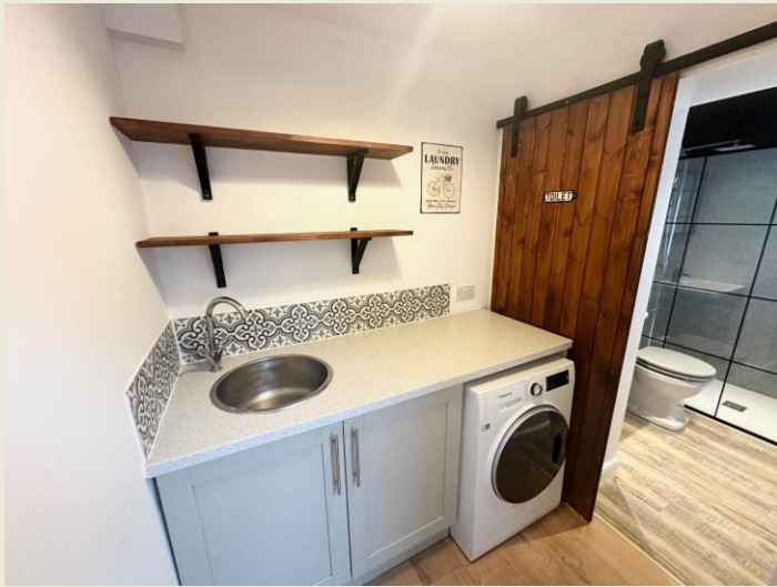
SHOWER ROOM & WC