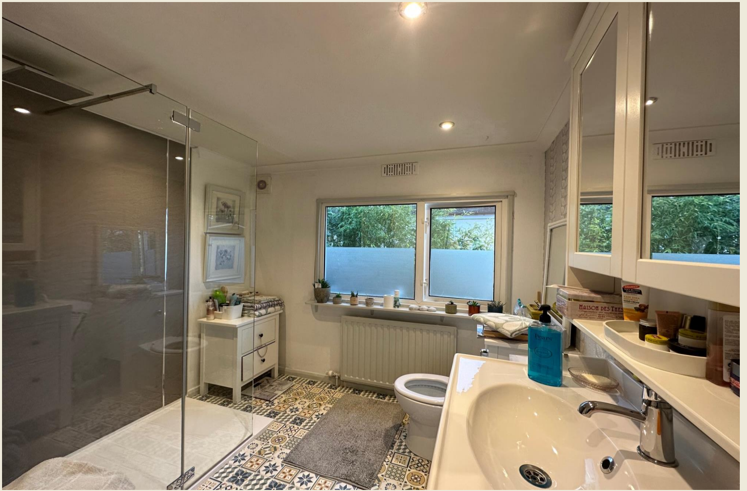
CONTEMPORARY SHOWER ROOM