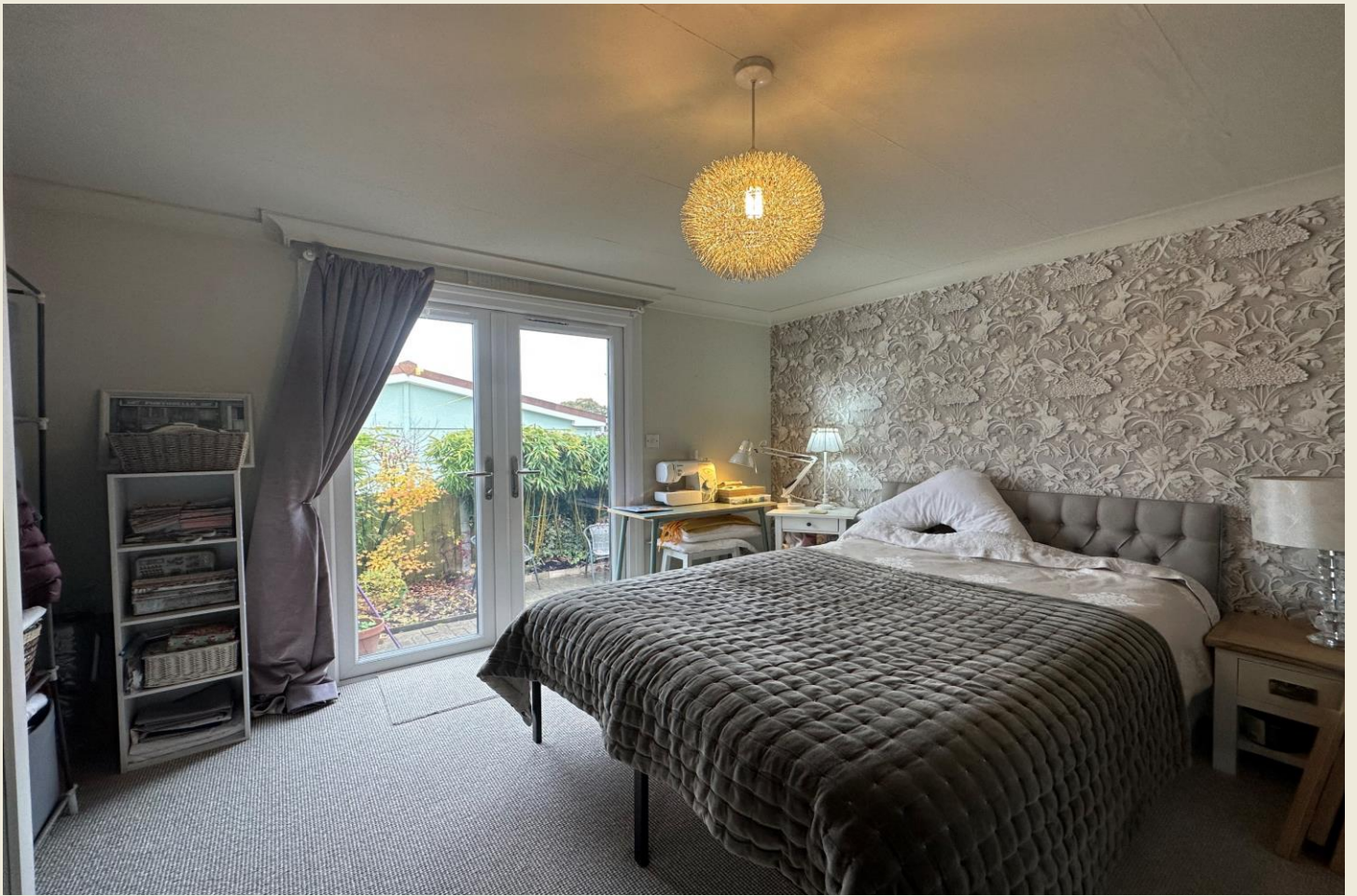
BEDROOM ONE (11'10 max x 11'10")