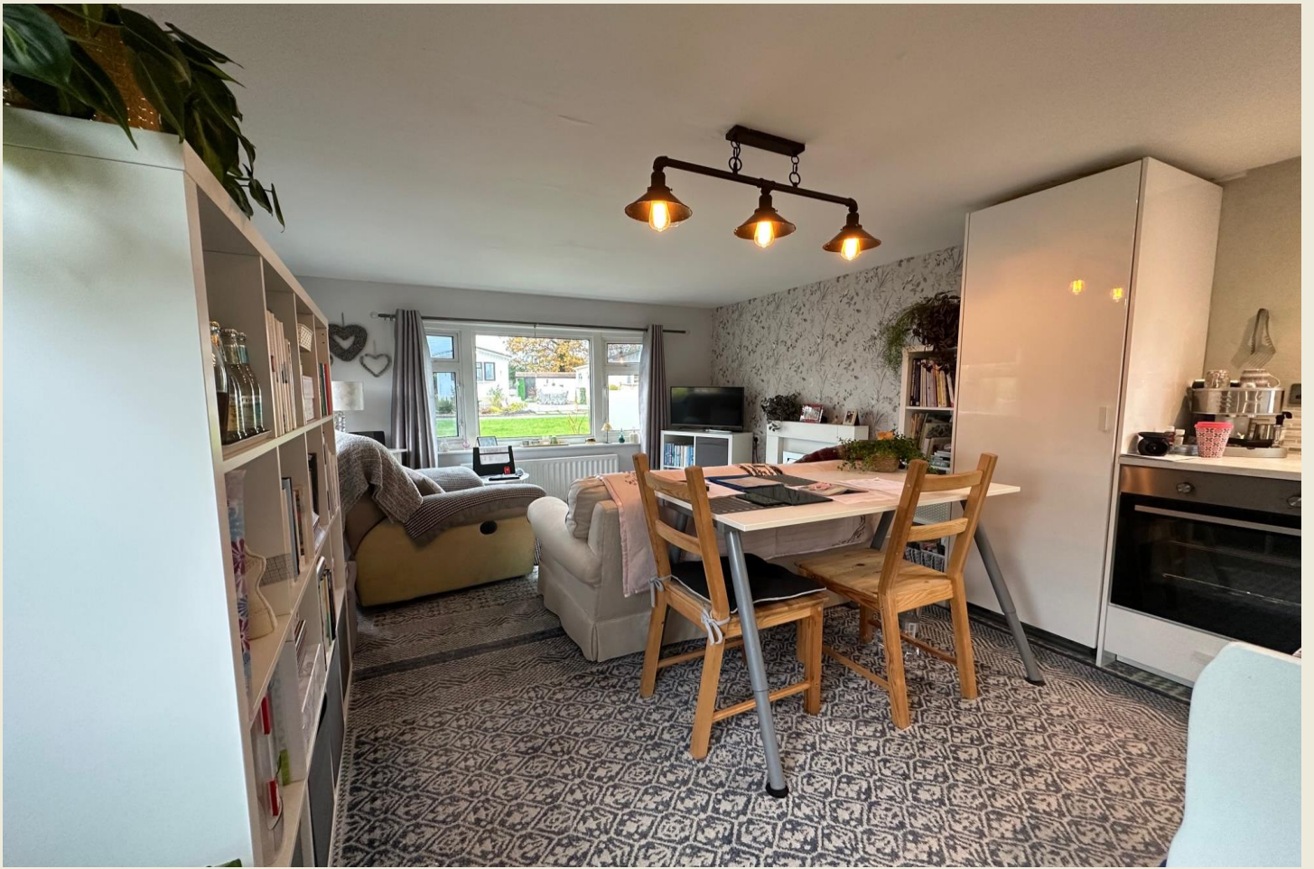
OPEN PLAN KITCHEN DINING LIVING ROOM (11'10" x 19'8")