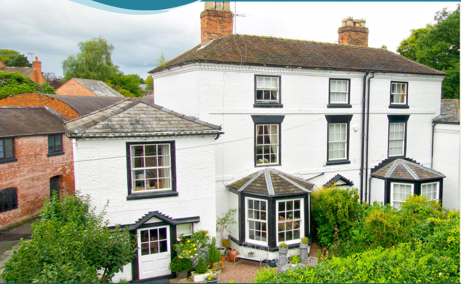
'IVY HOUSE' | 19 STAFFORD STREET | AUDLEM | CHESHIRE | CW3 0AR | £675,000