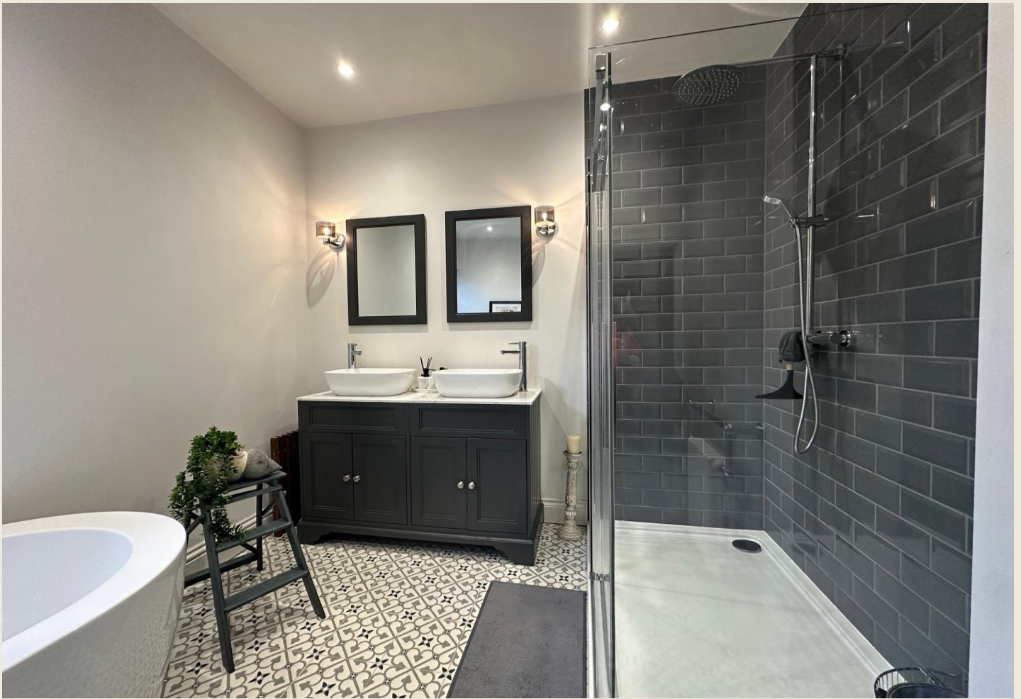
LUXURIOUS FAMILY BATH & SHOWER ROOM