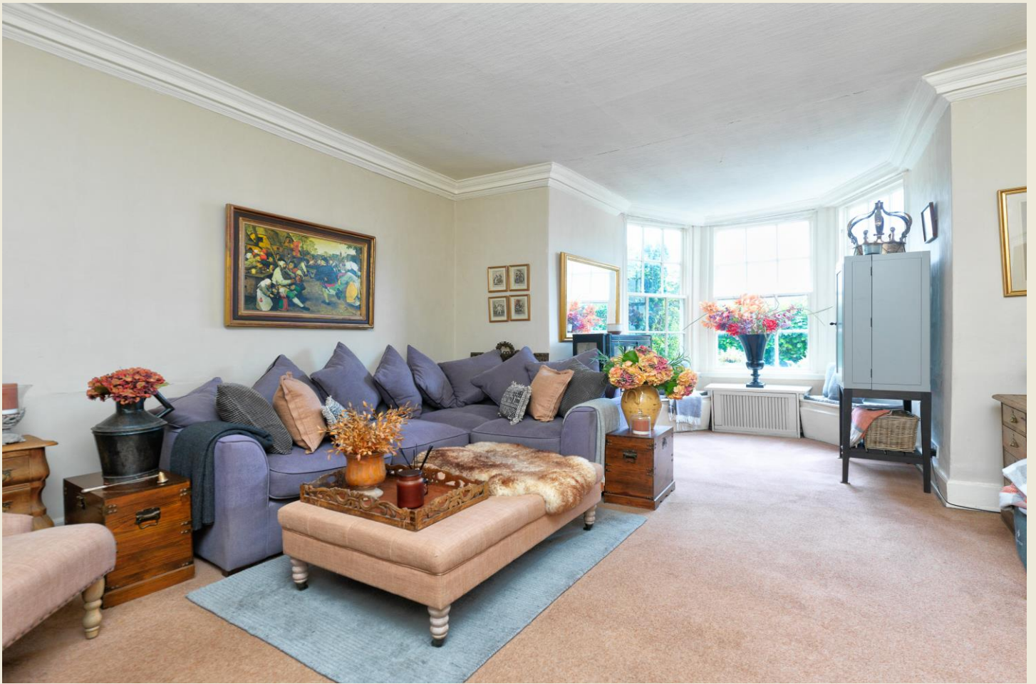
DRAWING ROOM (21'8 x 15'1 max)