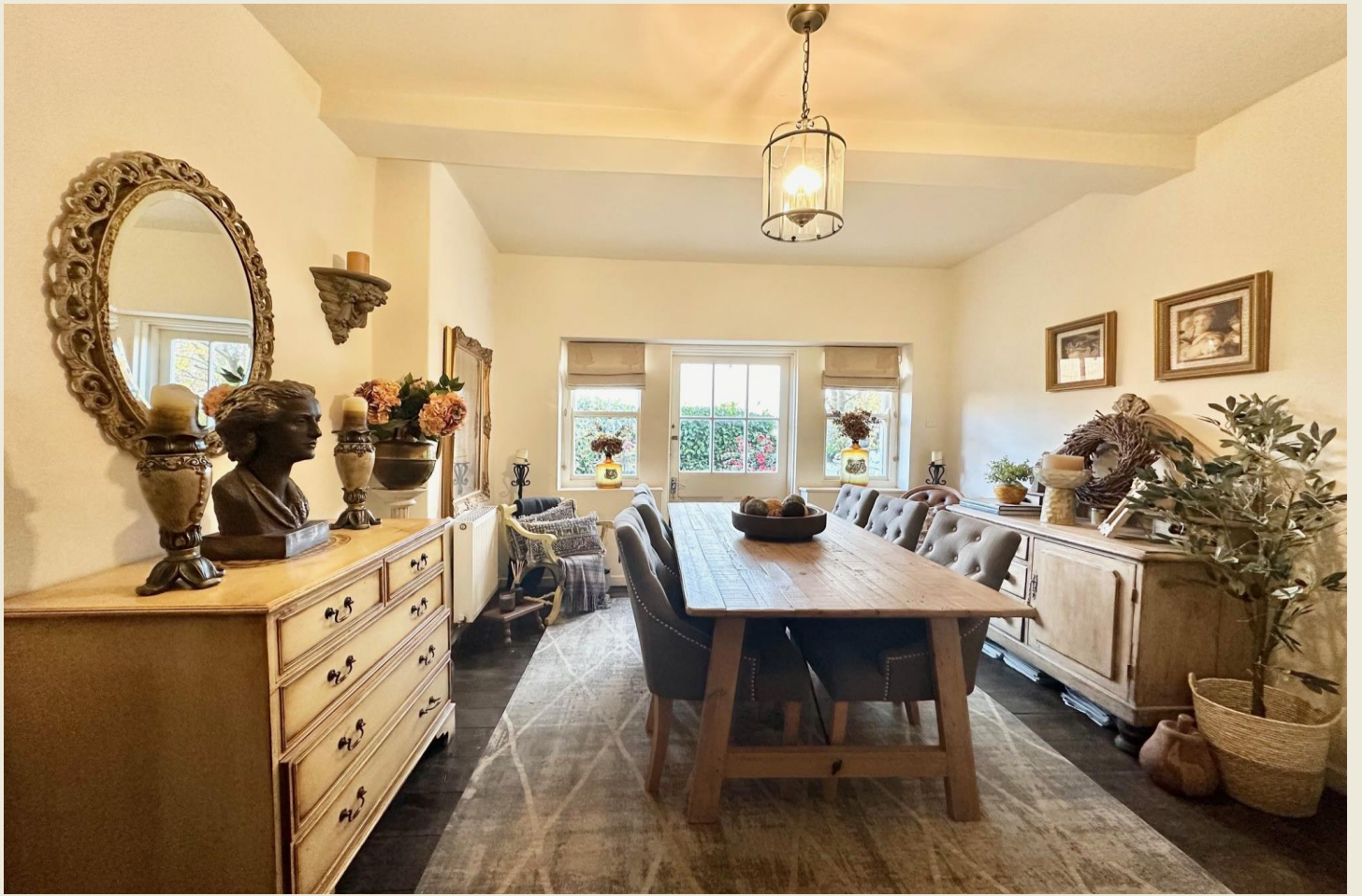
FORMAL DINING ROOM (17'5 max x 11'6)