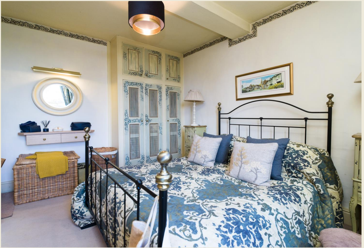
BEDROOM ONE (12'2 x 11'6)