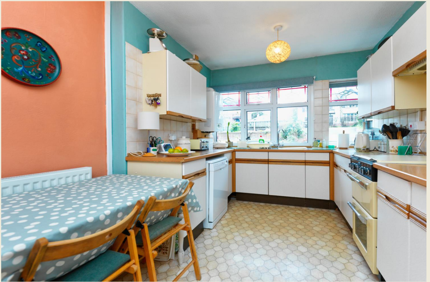
KITCHEN BREAKFAST ROOM (14'5" x 8'10")