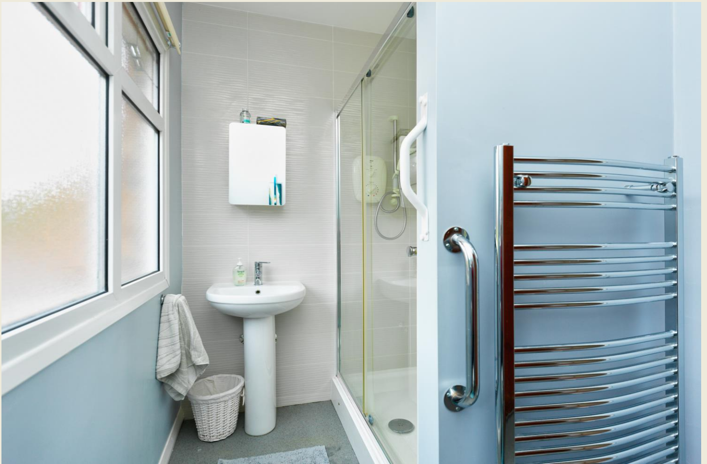
SHOWER ROOM / WC