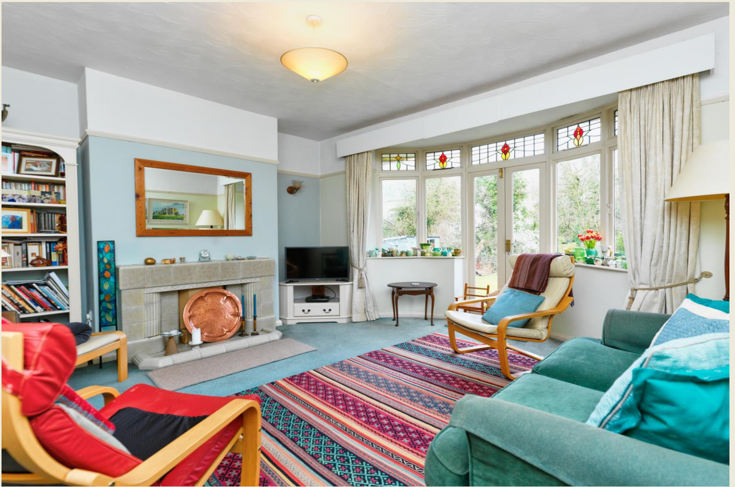
LIVING ROOM (11'10" x 14'5")