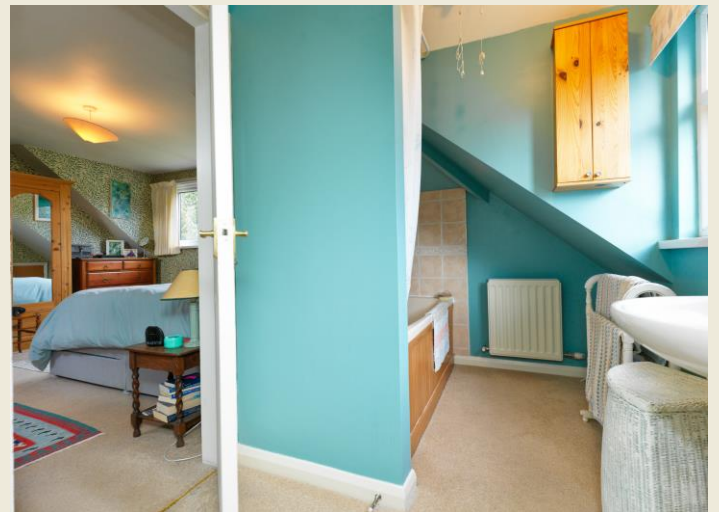
BEDROOM FOUR (16'0" x 9'6")