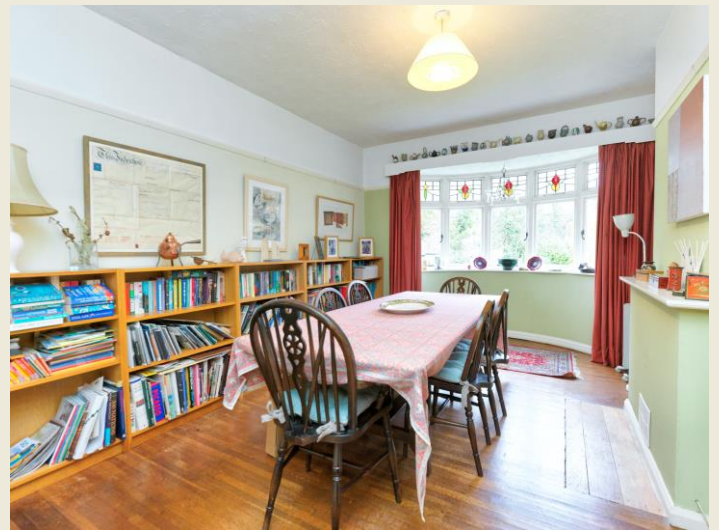
DINING ROOM (14'9" x 11'6")