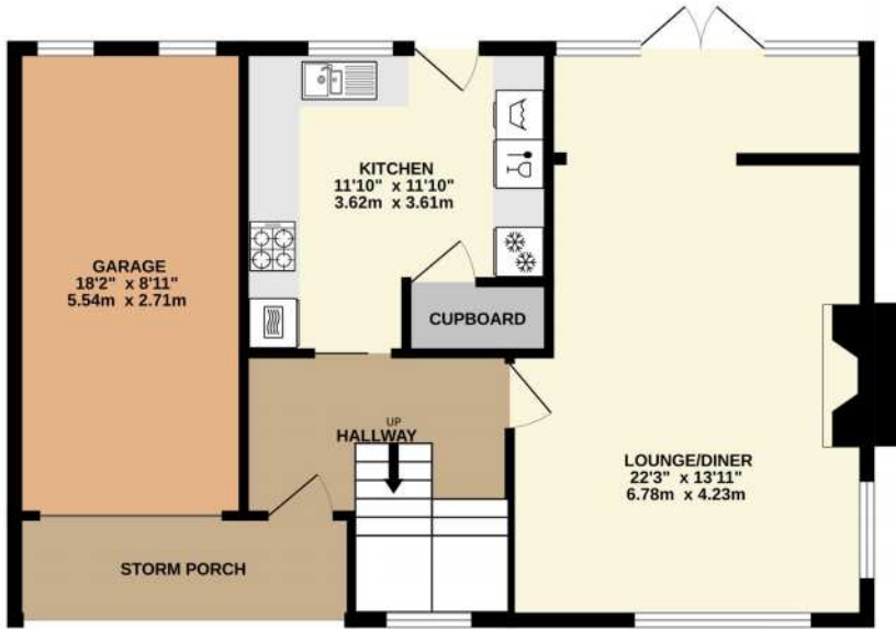
GROUND FLOOR 726 sq.ft. (67.5 sq.m.) approx.