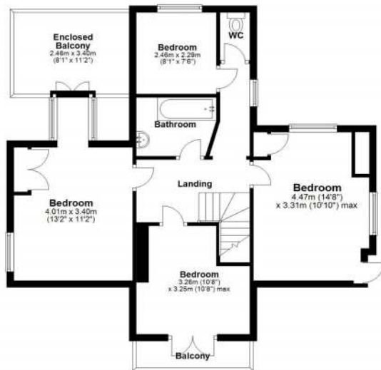
First Floor Approx. 61.9 sq. metres (665.9 sq. feet)

Total area: approx. 190.5 sq. metres (2050.7 sq. feet)