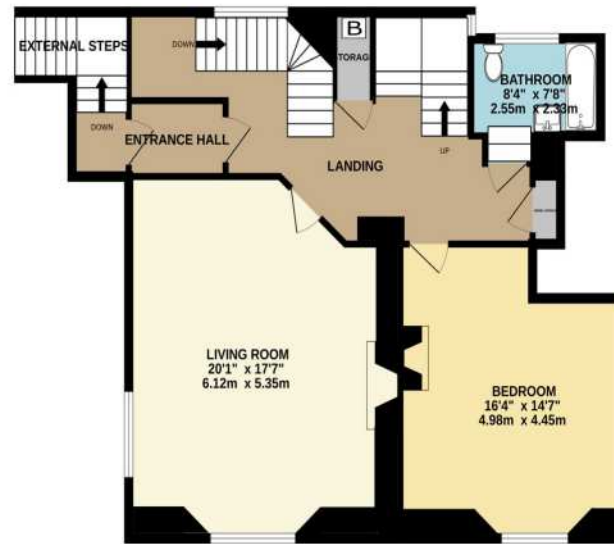
1ST FLOOR 847 sq.ft. (78.7 sq.m.) approx.