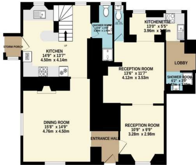
GROUND FLOOR 843 sq.ft. (78.3 sq.m.) approx.