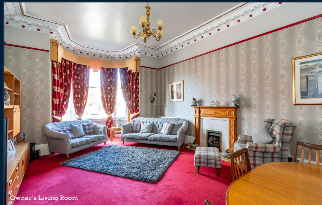
Owner's Living Room

Graham + Sibbald 40 Torphichen Street, Edinburgh, EH3 8JB