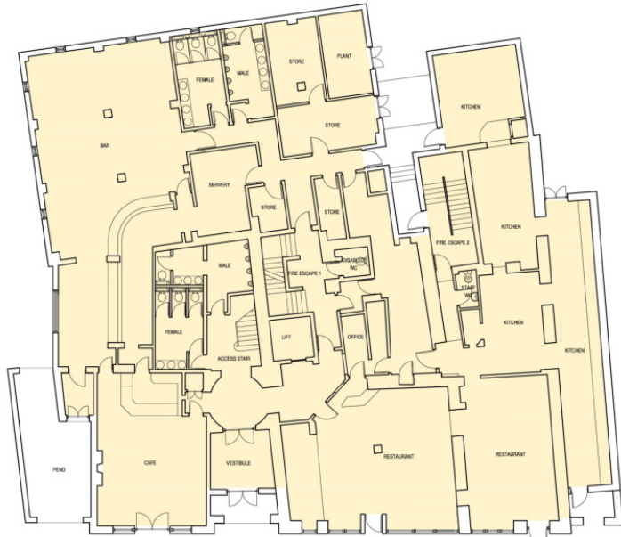
GROUND FLOOR PLAN- GROSS FLOOR AREA- 631 sq.m