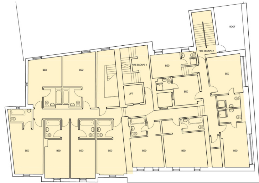
THIRD FLOOR PLAN- GROSS FLOOR AREA- 360 sq.m