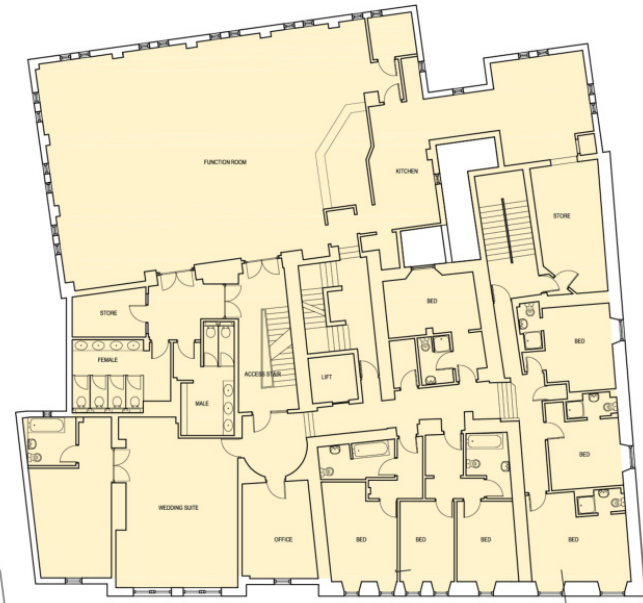
FIRST FLOOR PLAN- GROSS FLOOR AREA- 624 sq.m