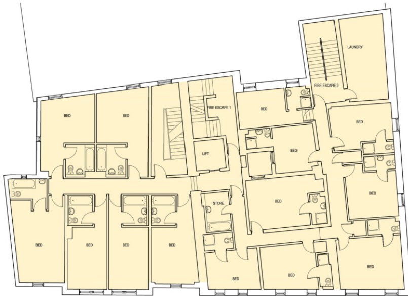
SECOND FLOOR PLAN- GROSS FLOOR AREA- 405 sq.m