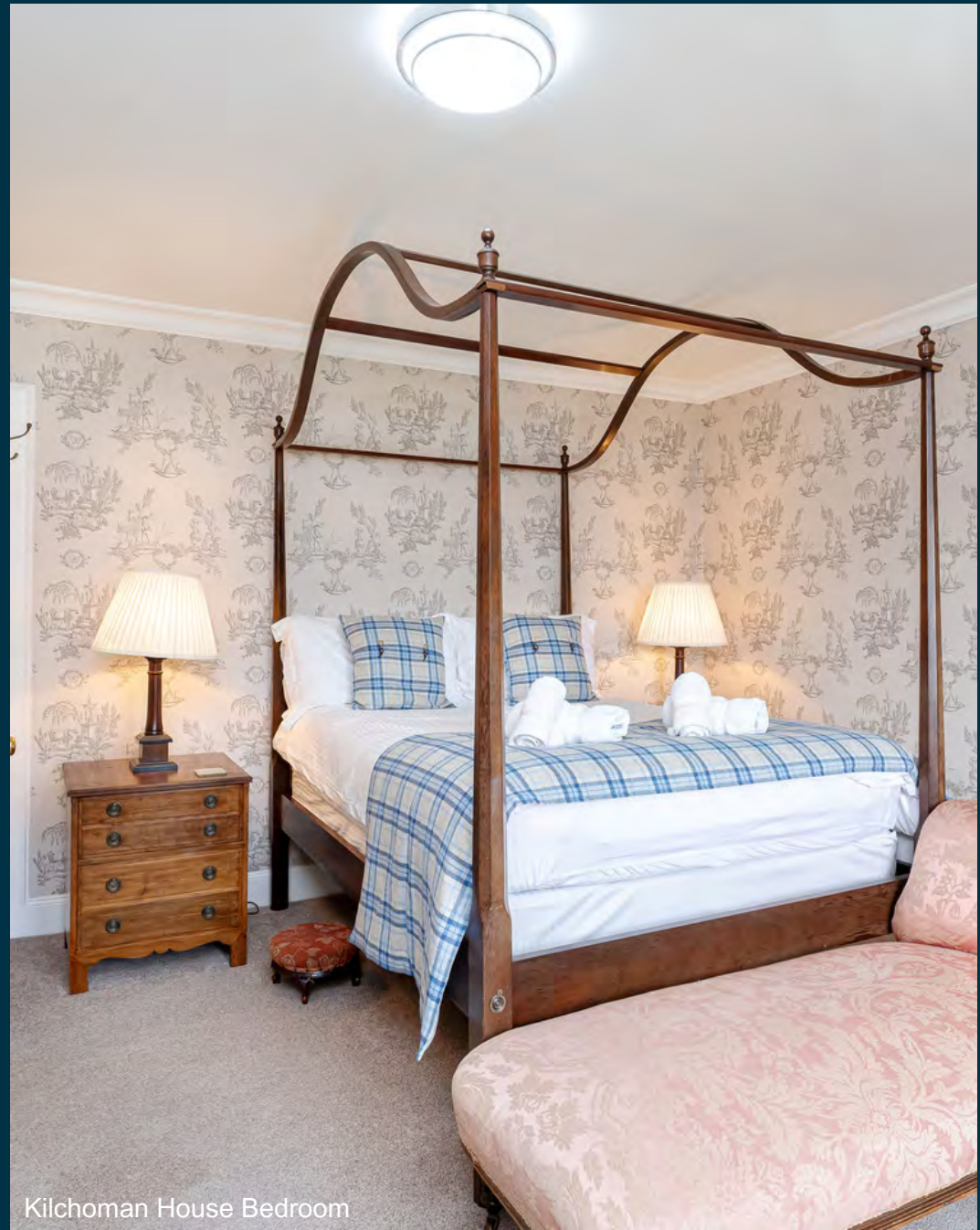
Kilchoman House Bedroom