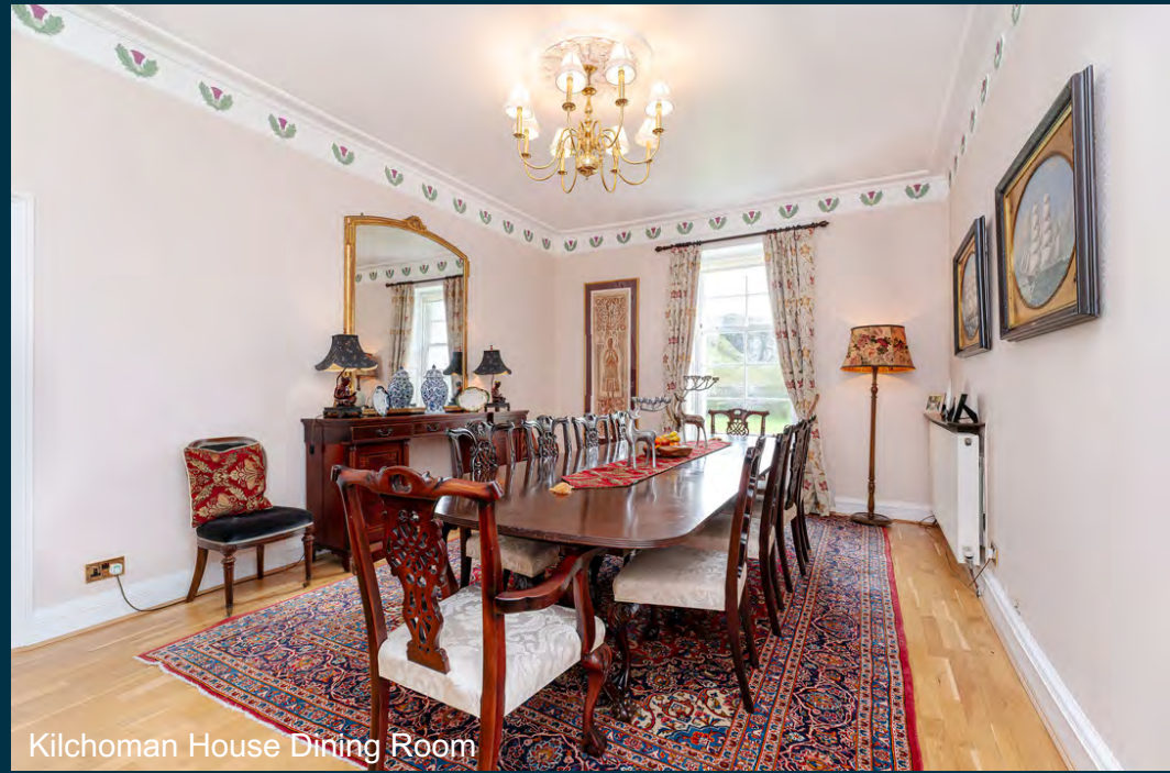
Kilchoman House Dining Room