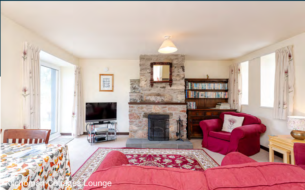
Kilchoman Cottages Lounge