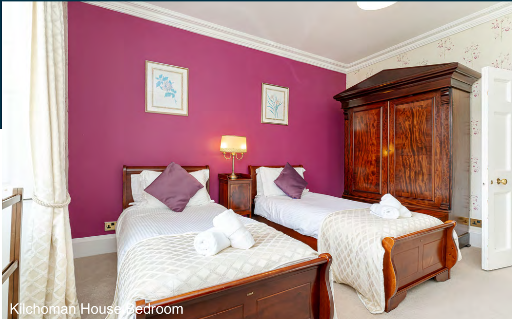
Kilchoman House Bedroom