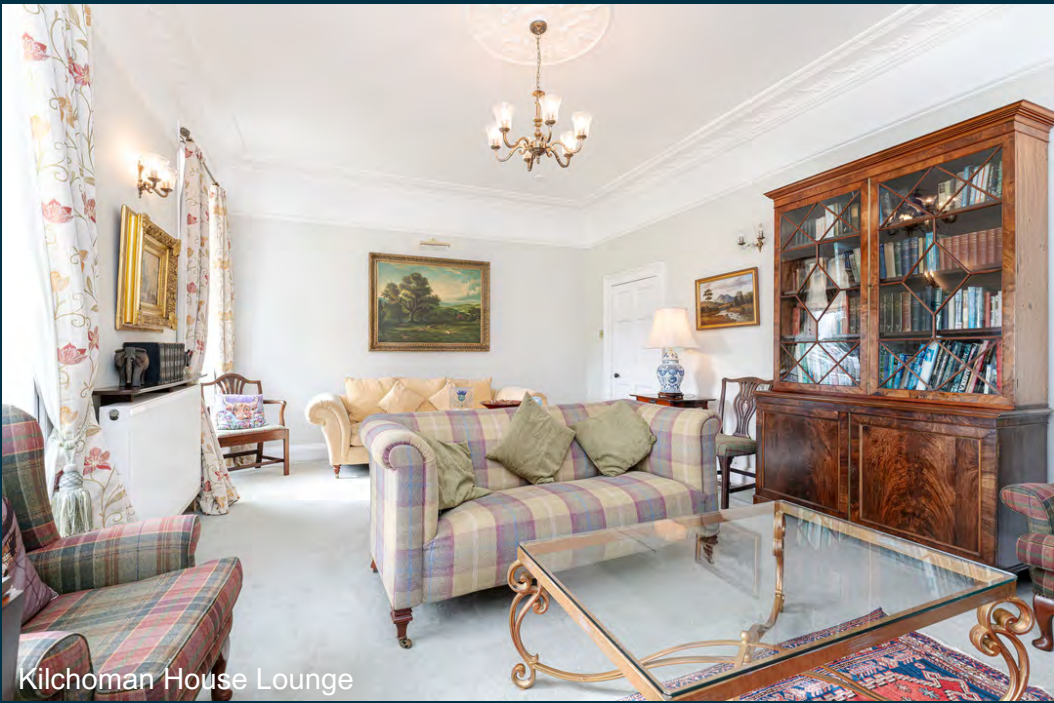
Kilchoman House Lounge