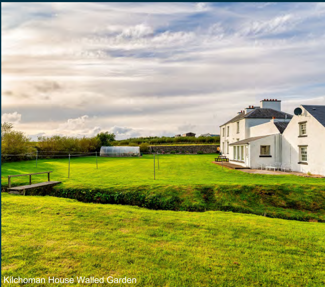
Kilchoman House Walled Garden