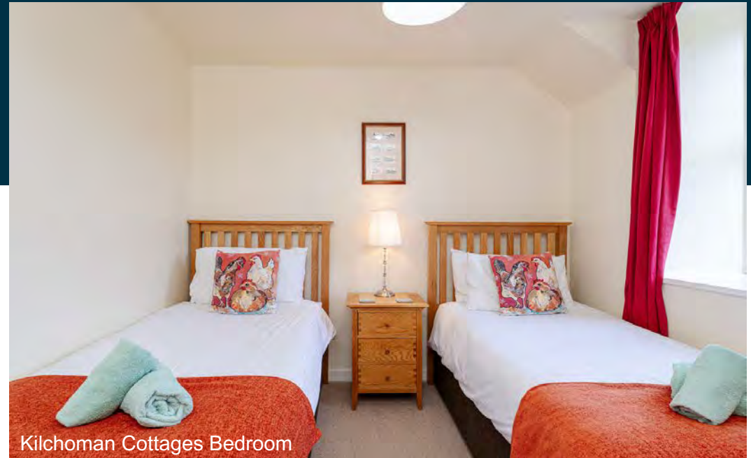
Kilchoman Cottages Bedroom