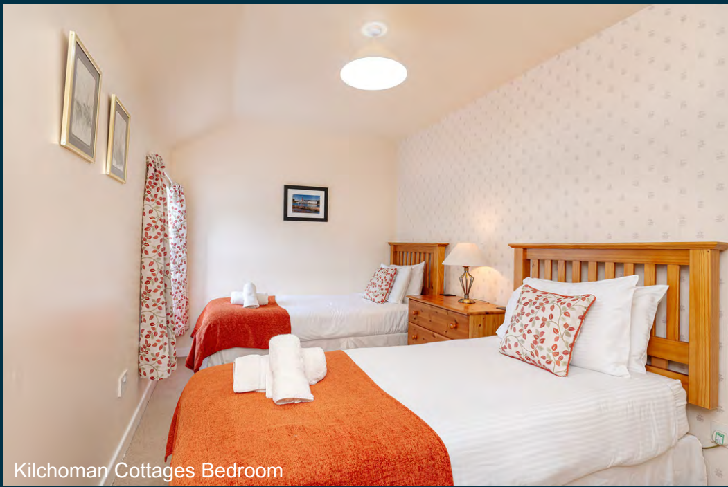
Kilchoman Cottages Bedroom