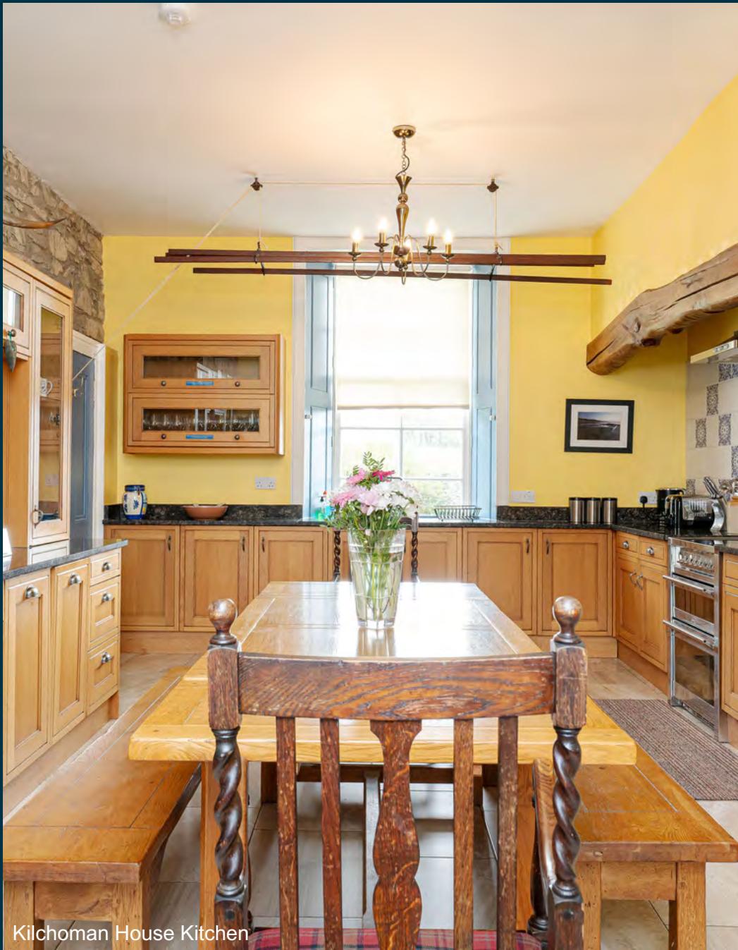
Kilchoman House Kitchen