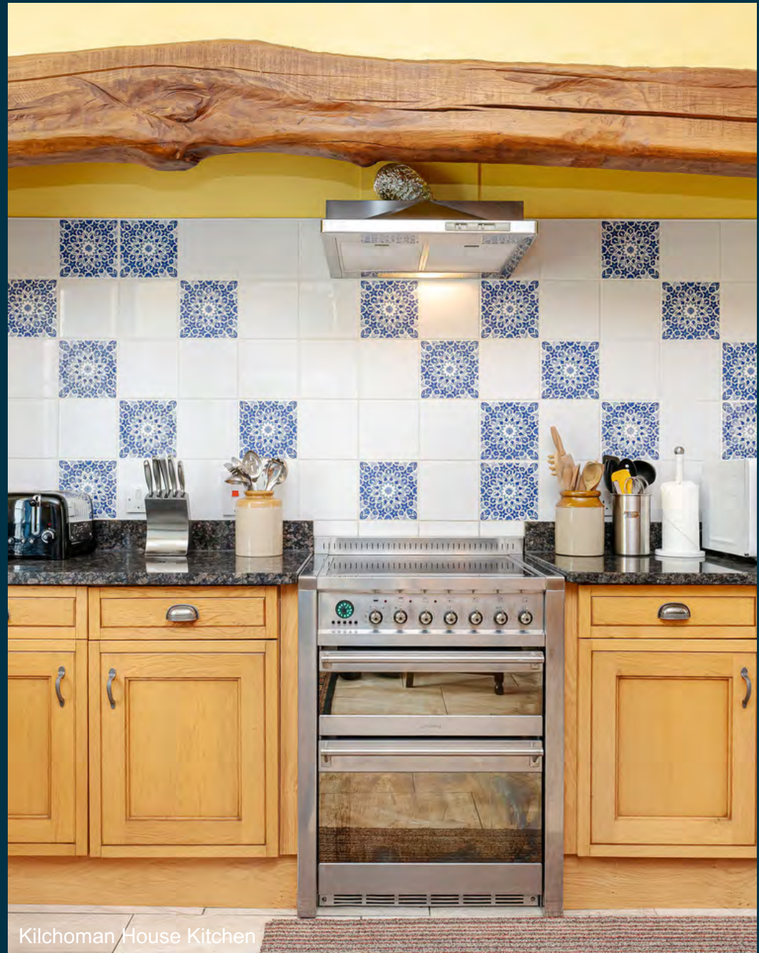
Kilchoman House Kitchen