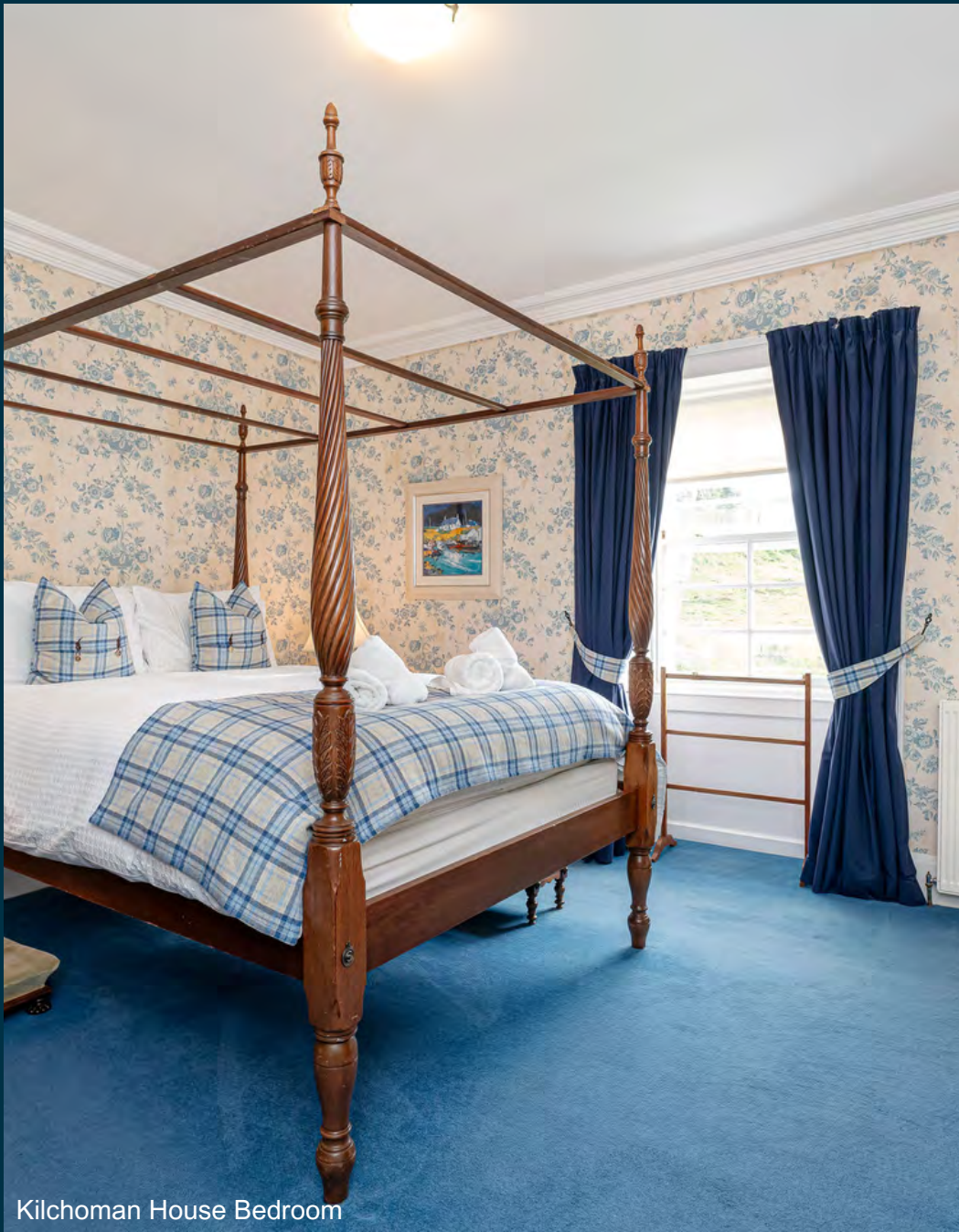
Kilchoman House Bedroom