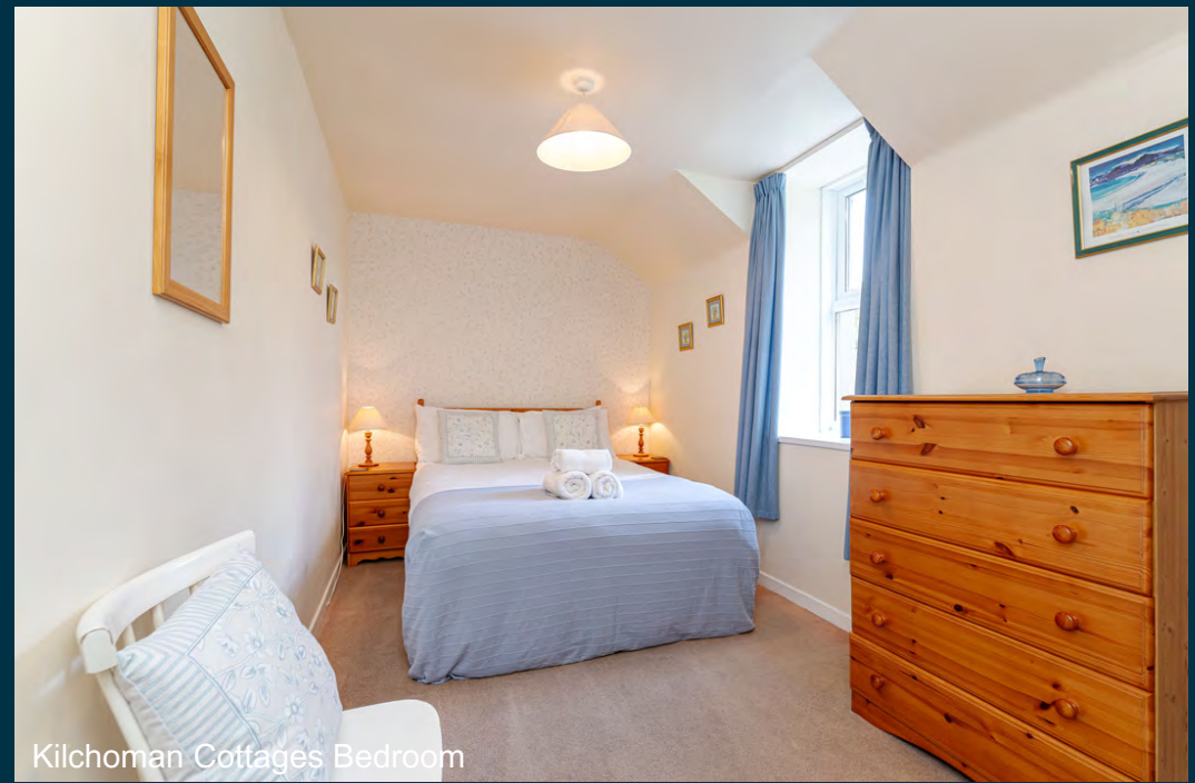
Kilchoman Cottages Bedroom