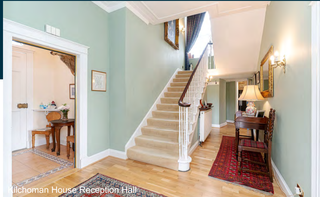
Kilchoman House Reception Hall