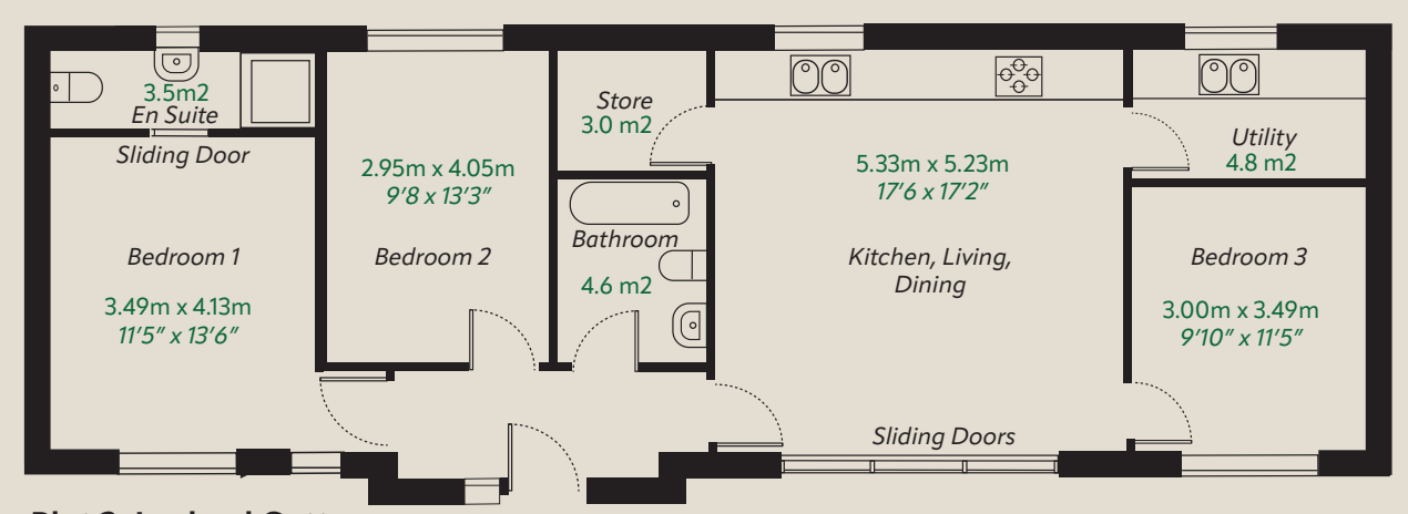
Plot 2, Leyland Cottage 3 Bedroom, 2 Bathroom. Gross Internal Floor Area: 91.4 m<sup>2</sup>

Gross Internal Floor Area: 92.4 m<sup>2</sup>