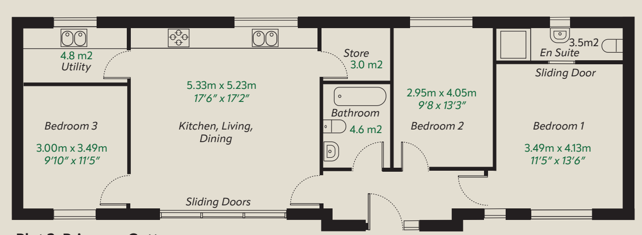
Plot 3, Primrose Cottage 3 Bedroom, 2 Bathroom Gross Internal Floor Area: 91.4 m<sup>2</sup>.