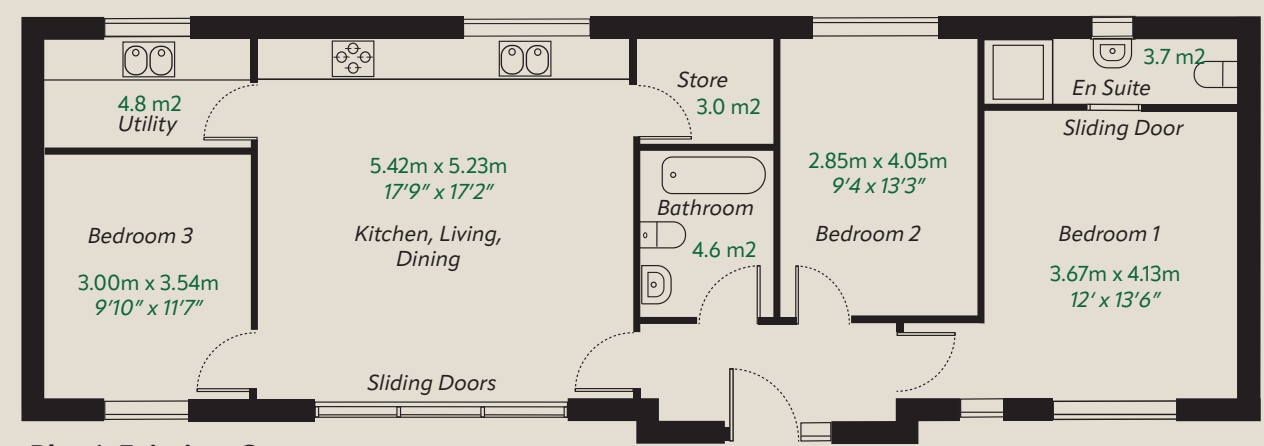
Plot 1, Fairview Cottage 3 Bedroom, 2 Bathroom

Gross Internal Floor Area: 92.4 m<sup>2</sup>