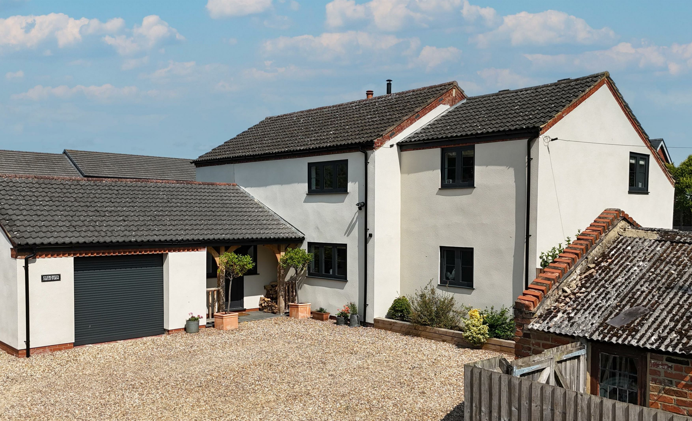
Evergreen Fields Farm, Pincet Lane, North Kilworth, LE17 6NE