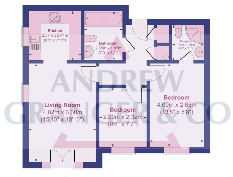
Floor area 56.6 sq.m. (609 sq.ft.) approx

Not to scale for layout reference only. All Measurements are Approximate Produced by As built Energy Surveys for Andrew Granger & Co orders@asbuillenergysurveys.co.uk