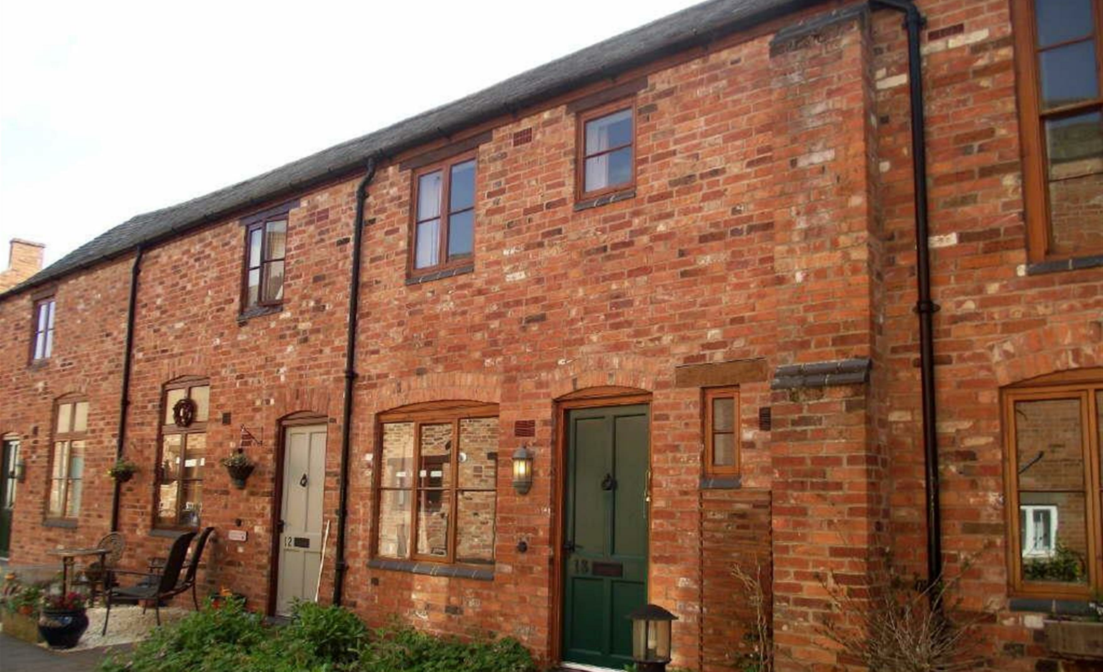
Aldwinckles Yard, Market Harborough, LE16 7AL