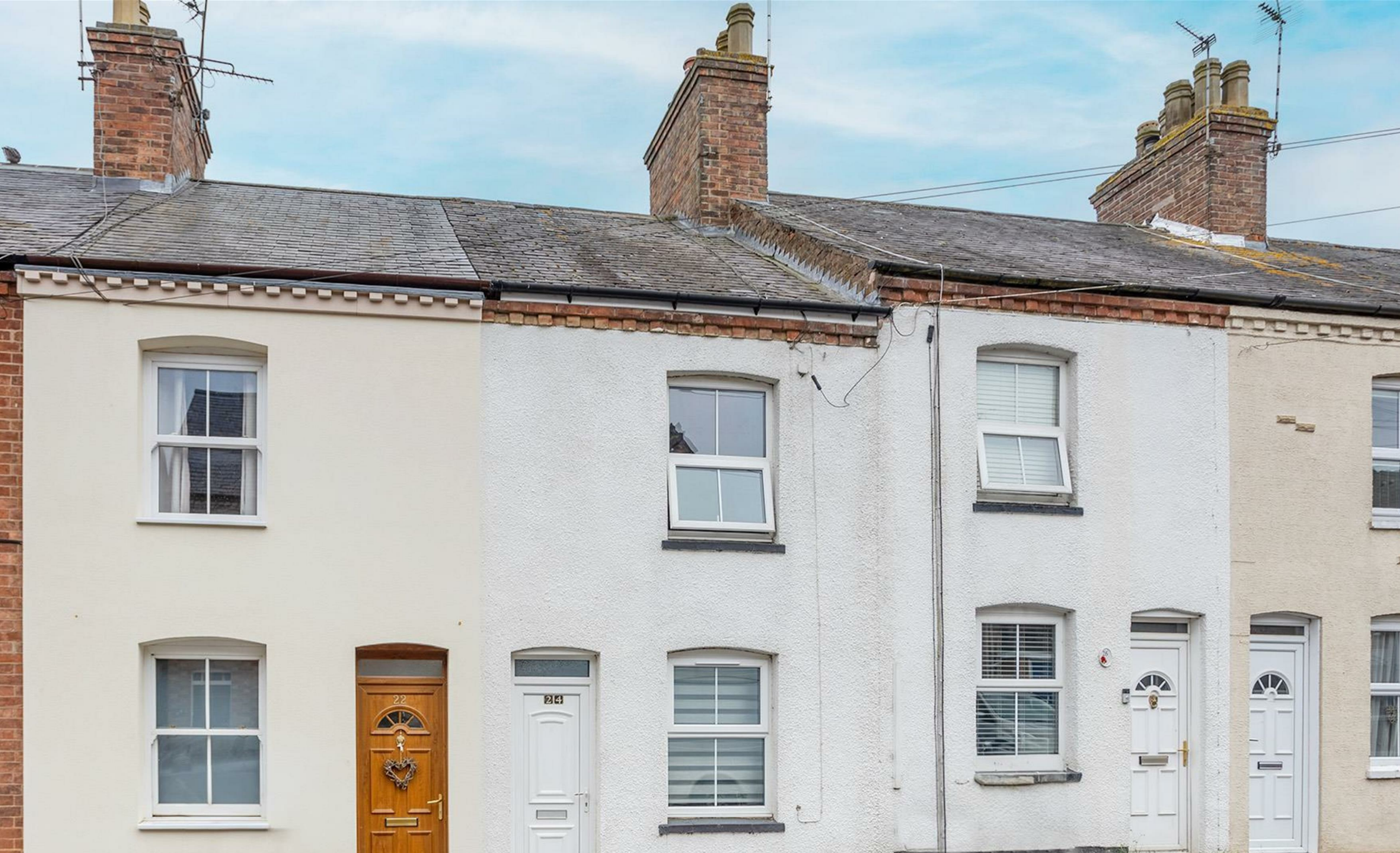
Gladstone Street, Fleckney, LE8 8AG