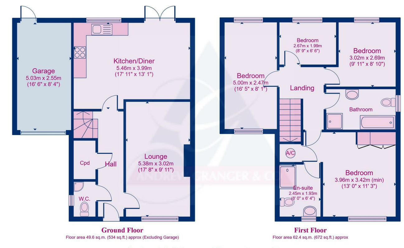
Floor plans are for identification purposes only. All measurements are approximate. Created using Vision Publisher™