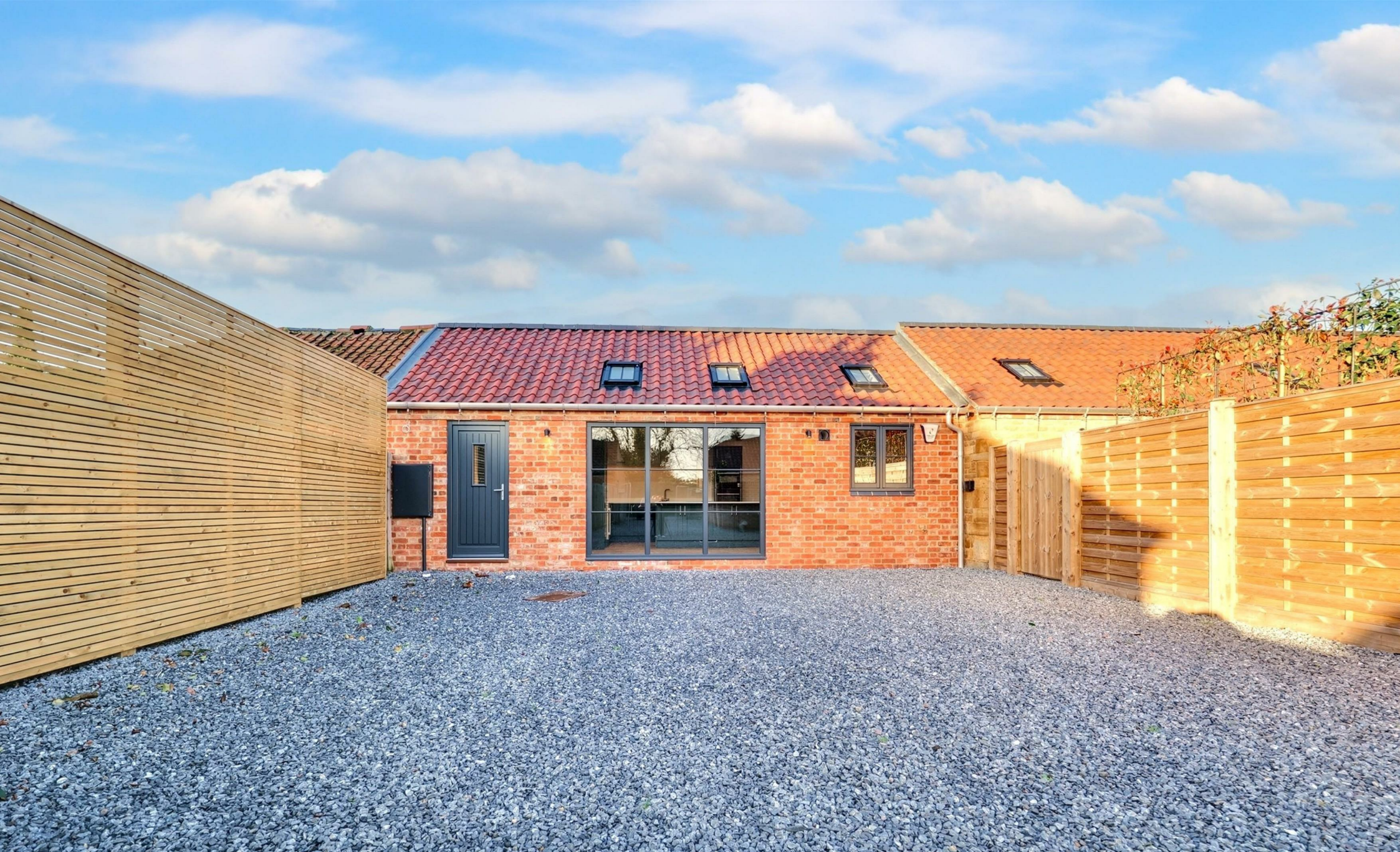
Mistletoe Barn, Belvoir Road Redmile NG13 0GL