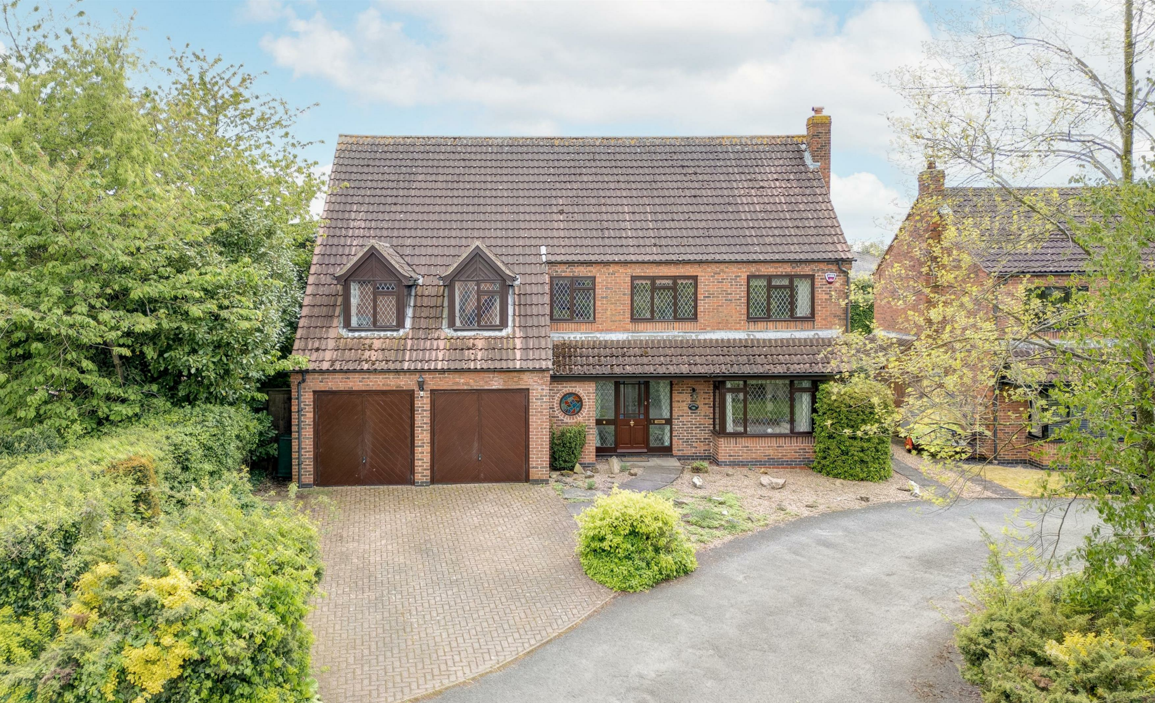
'Barnside', The Old Engine Yard Rempstone LE12 6RP