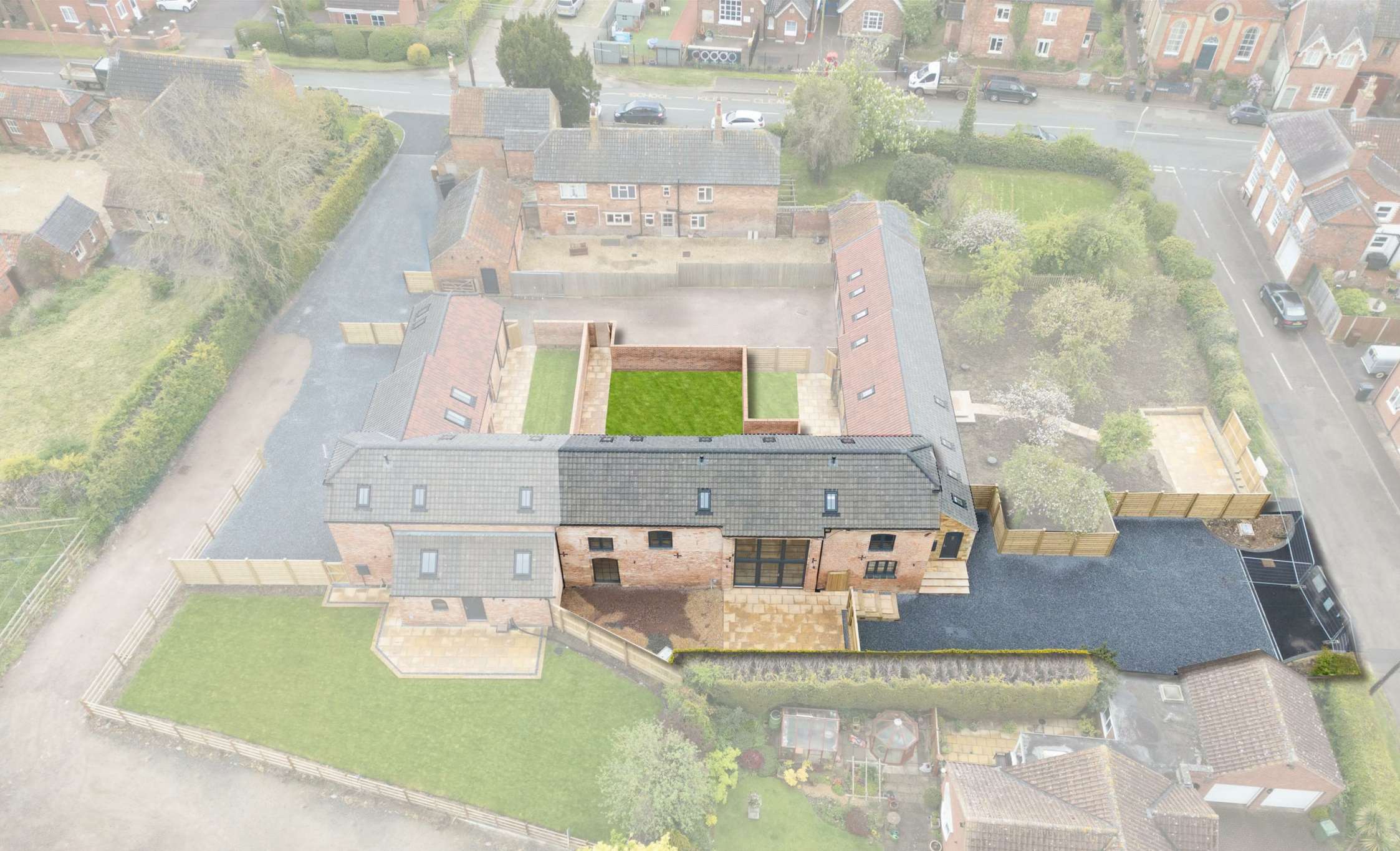
The Granary, Post Office Lane Redmile NG13 0GG