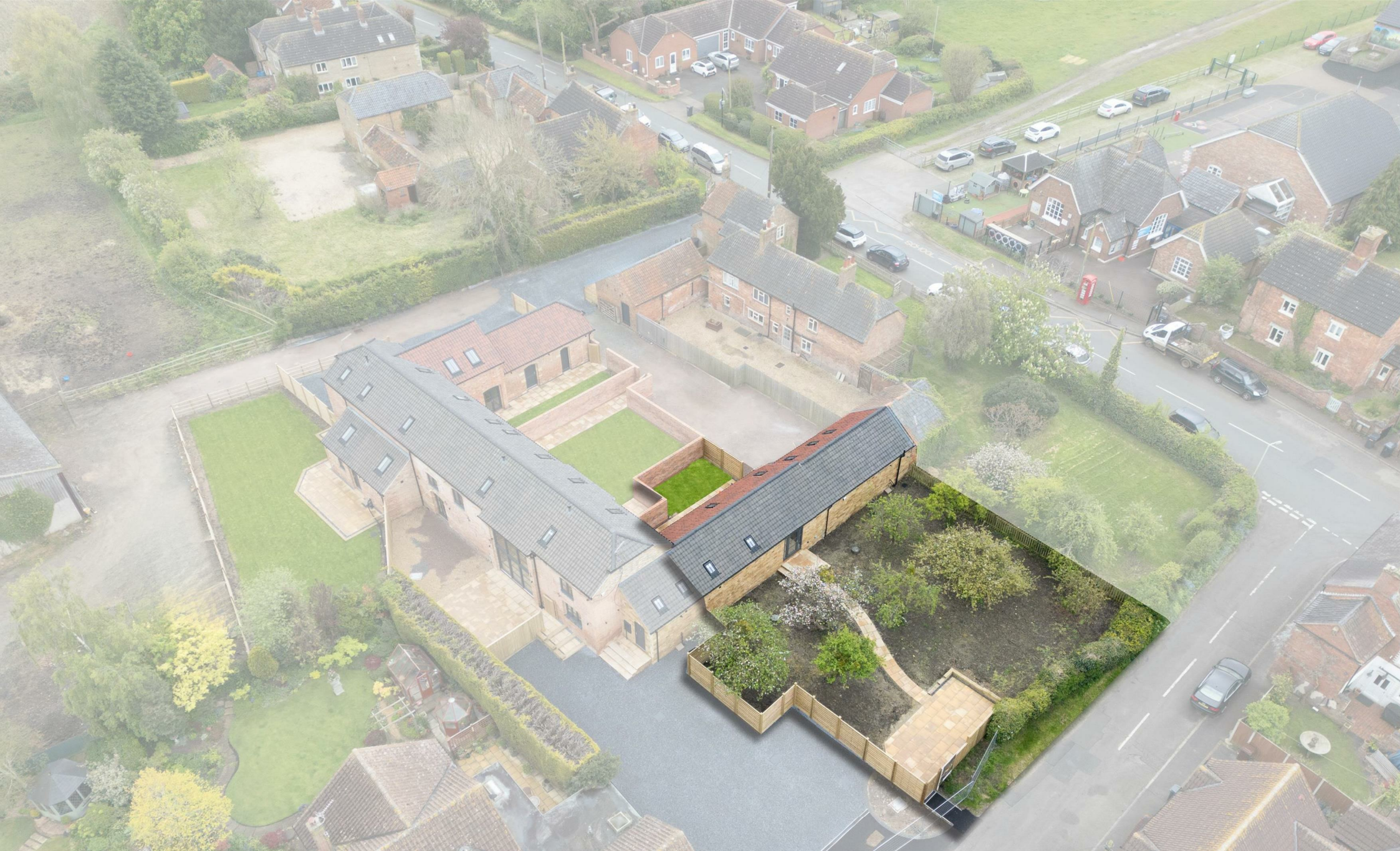
Mistletoe Barn, Belvoir Road Redmile NG13 0GL