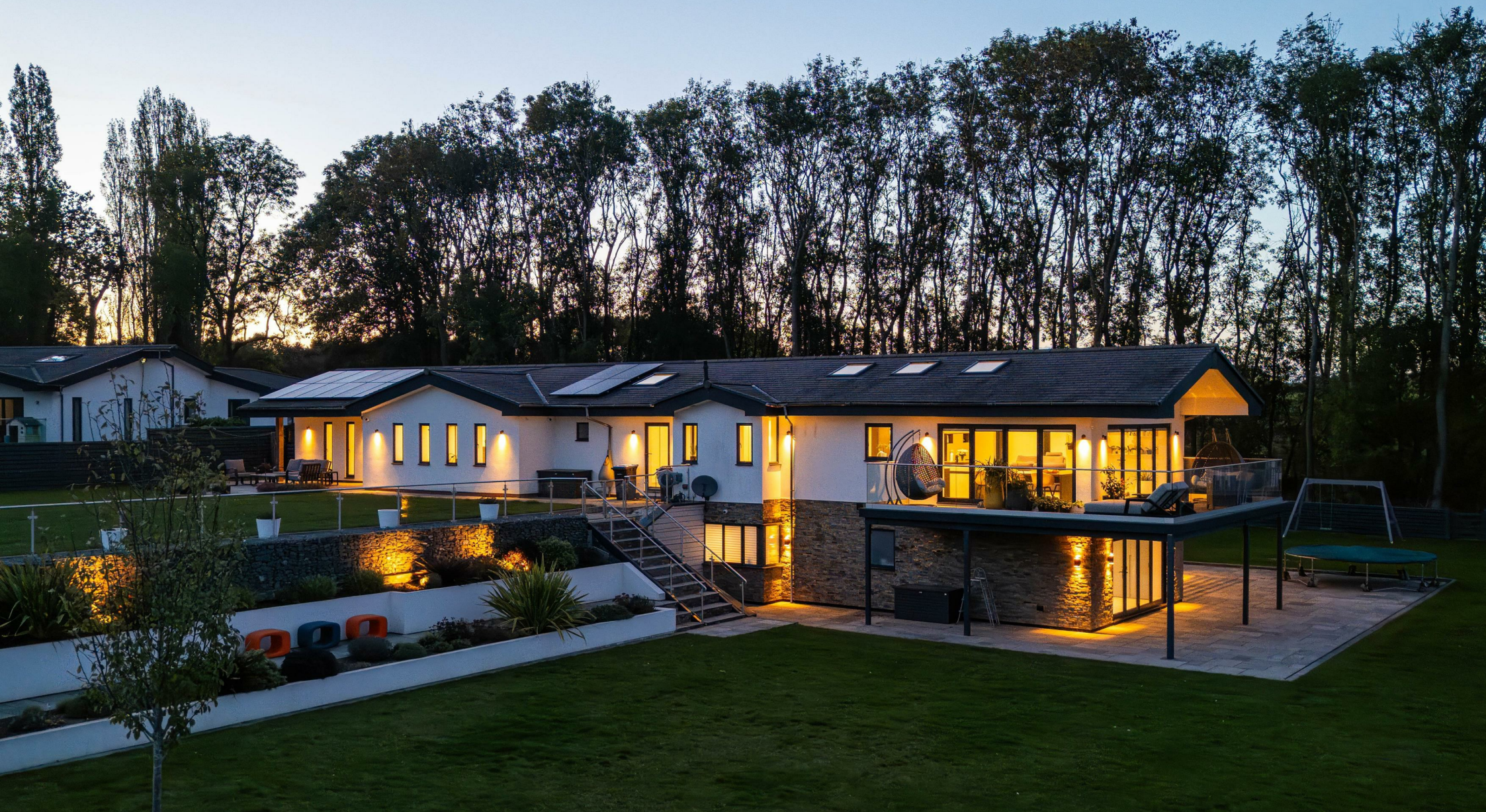
Chestnut House, Stretton Hall, LE2