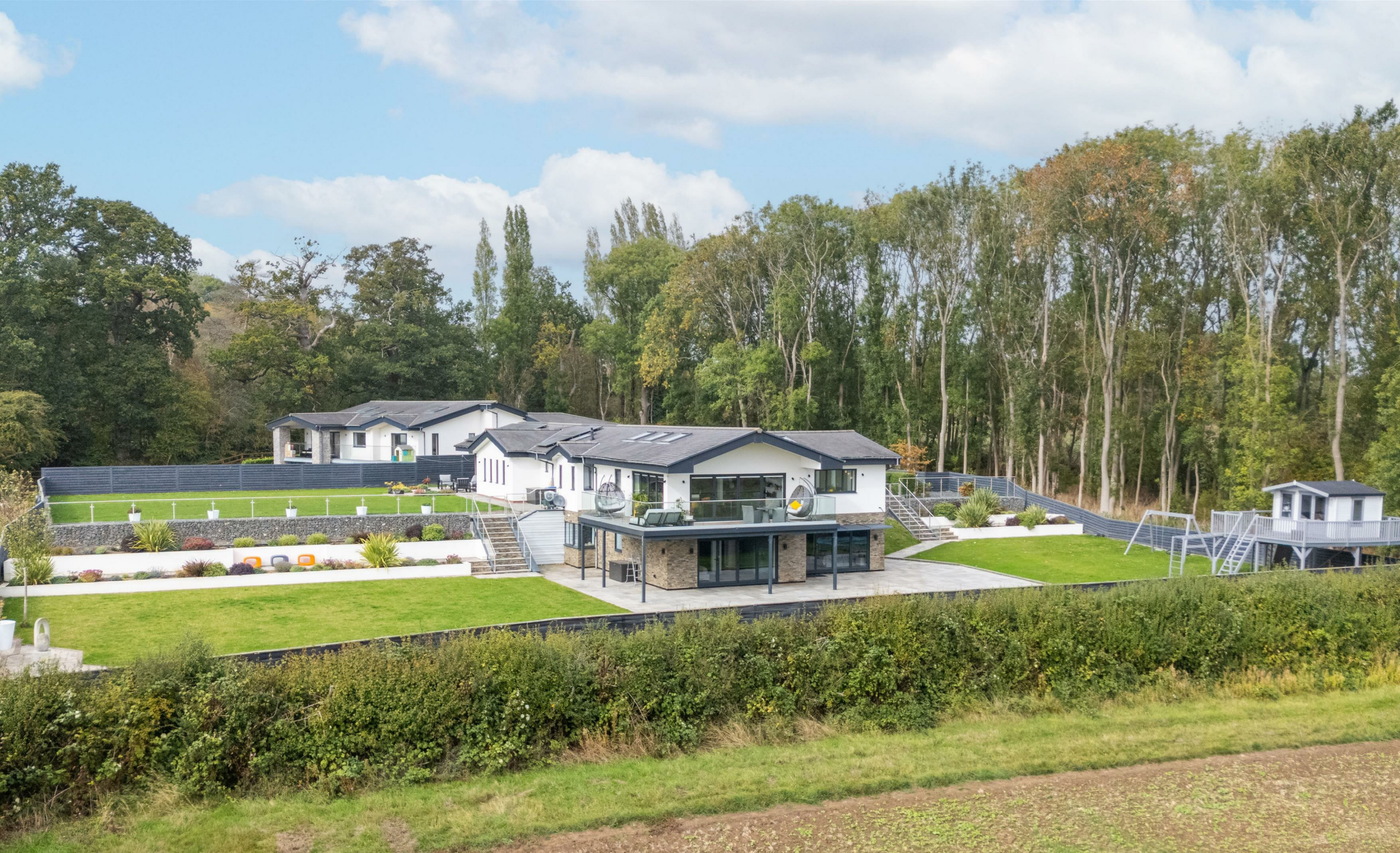
Chestnut House, Stretton Hall, LE2