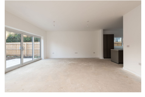
INCENTIVES AVAILABLE ON SELECTED PLOTS....Contact us now for more information!

An exceptional development of 14 High Specification Private Homes, within the beautiful hamlet of East Studdal. If you are seeking views, countryside and tranquillity look no further.