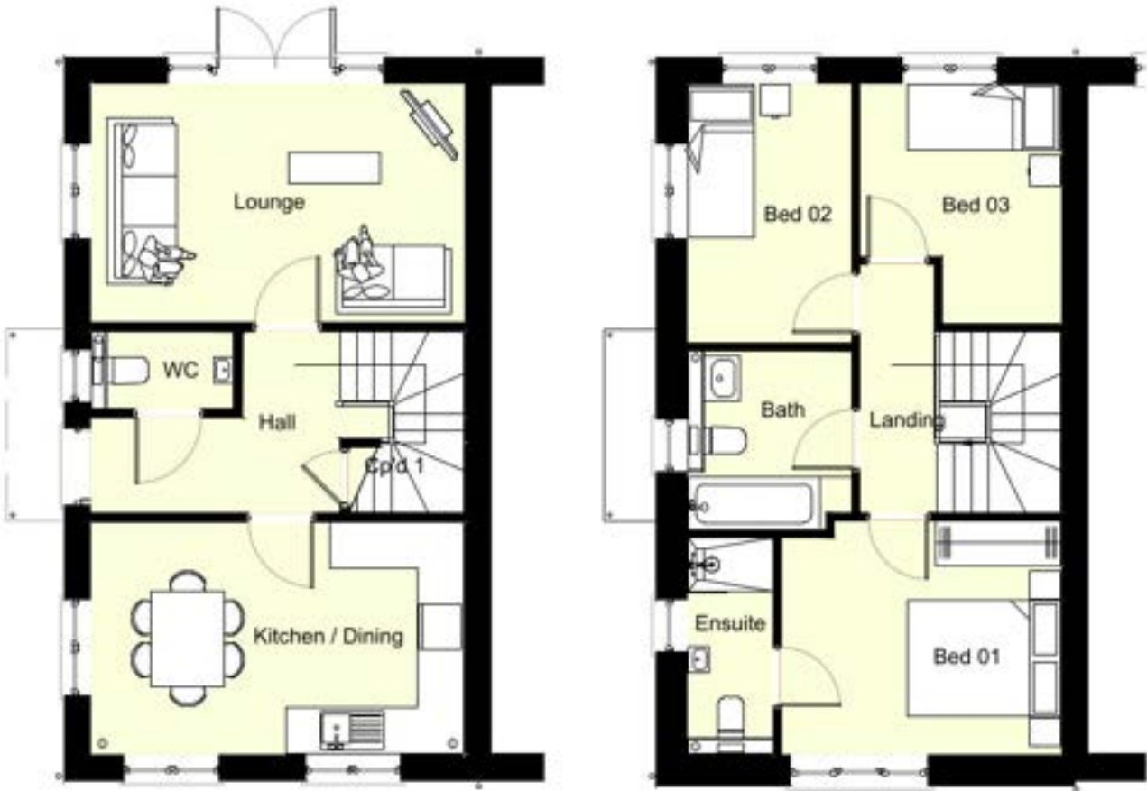
Ground Floor Layout Plot 1 (Plot 3 Handed)

Every property features off road parking, exterior lighting and smart charging electric vehicle ports. Professionally landscaped gardens, with planting, fencing and paving all included.