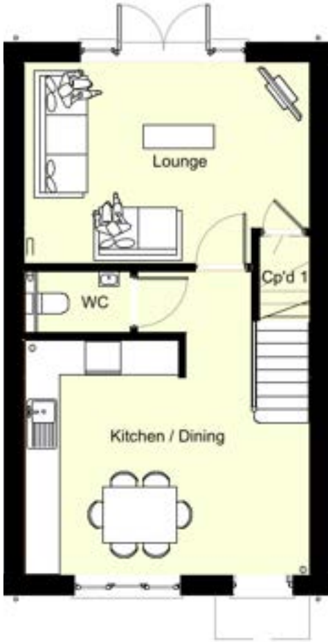
Ground Floor Layout Plot 2, 5 & 8 (Plot 4, 6 & 7 Handed)