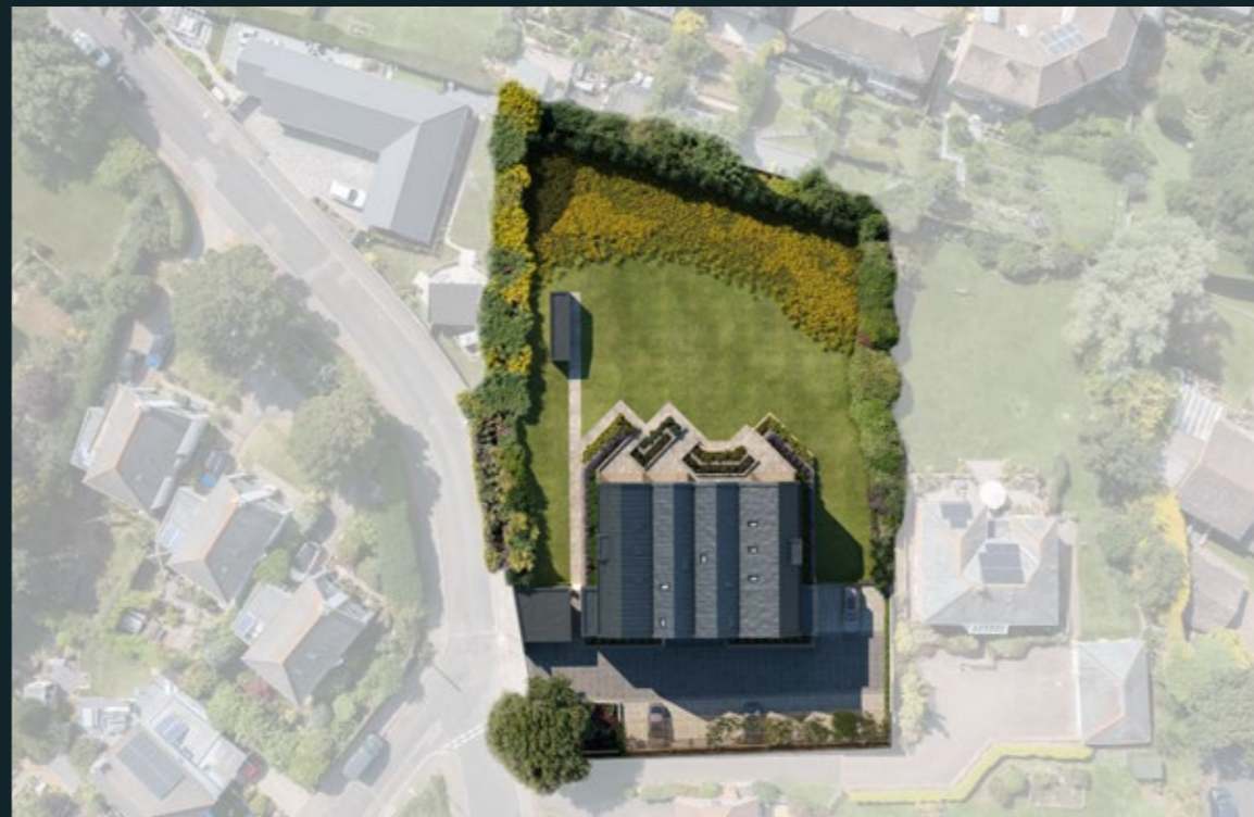
Computer generated images

Coastlands is a collection of eight luxury apartments, set in an elevated position in the vibrant town of Hythe. As with many of the most successful coastal developments, bold architecture and clever orientation make Coastlands a desirable statement address from day one. Exceptional features include glass-fronted balconies, panoramic windows, a distinctive roofline, an extensive landscaped communal garden and allocated parking.