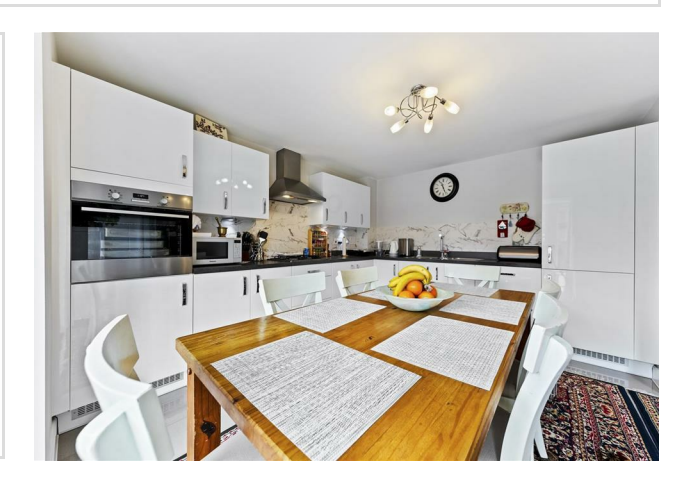
You may download, store and use the material for your own personal use and research. You may not republish, retransmit, redistribute or otherwise make the material available to any party or make the same available on any website, online service or bulletin board of your own or of any other party or make the same available in hard copy or in any other media without the website owner's express prior written consent. The website owner's copyright must remain on all reproductions of material taken from this website.