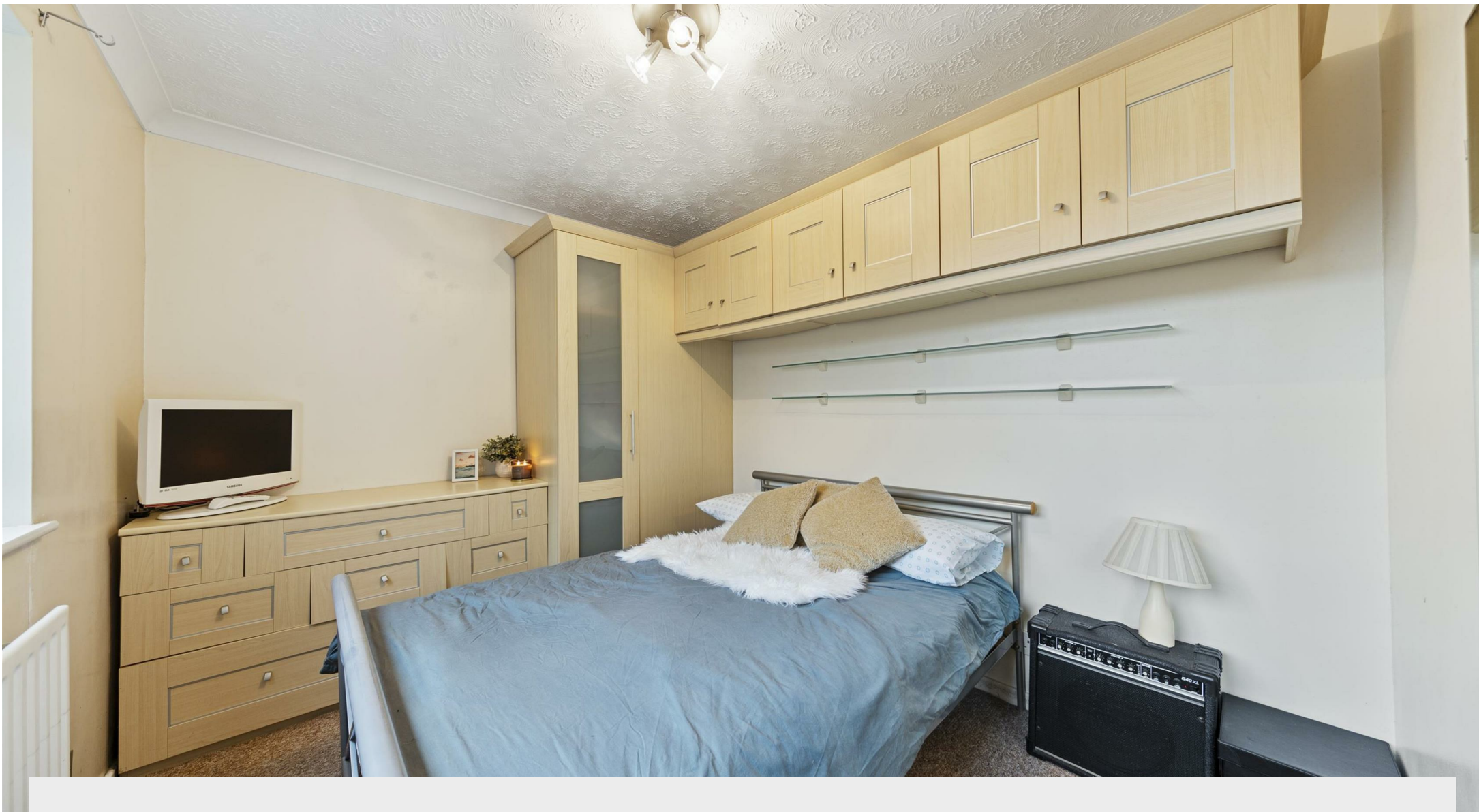
Spacious ground floor bedroom with a window injecting natural light, fitted storage, conveniently positioned next to a three-piece suite shower room.