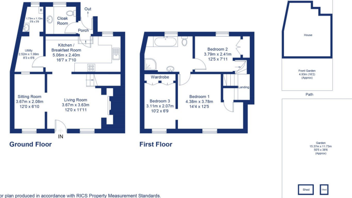
Floor plan produced in accordance with RICS Property Measurement Standards. Produced for Fortnum's Estates. Unauthorised reproduction prohibited. (ID1084276)

Littleworth Road, OX10 Approximate Gross Internal Area = 94.1 sq m / 1013 sq ft Garden / Driveway Area = 249.1 sq m / 2681 sq ft For identification only - Not to scale