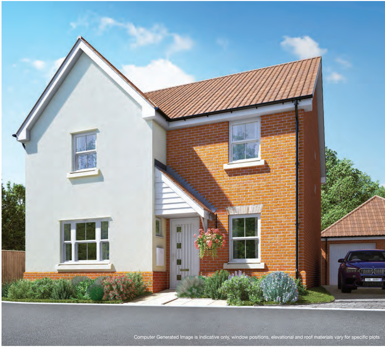
Computer Generated Image is indicative only, window positions, elevational and roof materials vary for specific plots