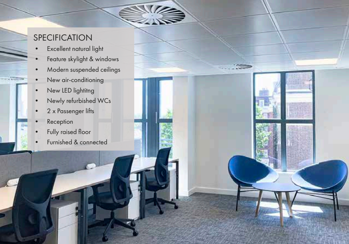
fifth floor meeting room