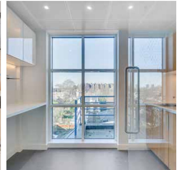
fifth floor kitchen