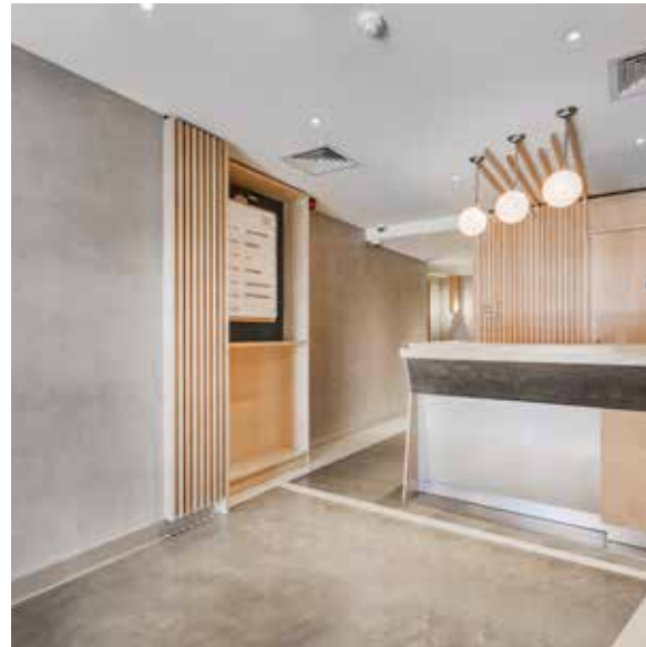
ground floor reception