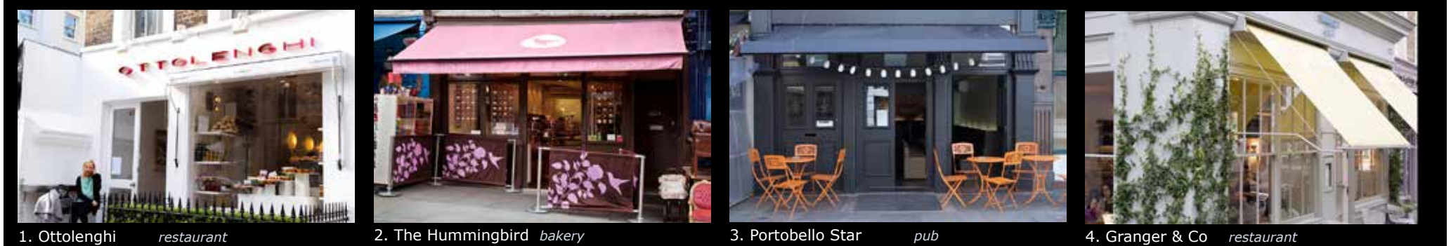
1. Ottolenghi restaurant

Misrepresentation Act 1967: These particulars are believed to be correct but their accuracy is not guaranteed and they do not form part of any contract. Unless otherwise stated, all prices and rents are quoted exclusive of VAT. Brochure September 2022