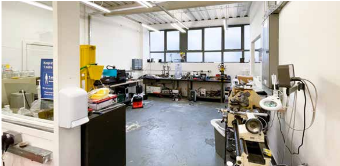
LOWER GROUND STUDIO