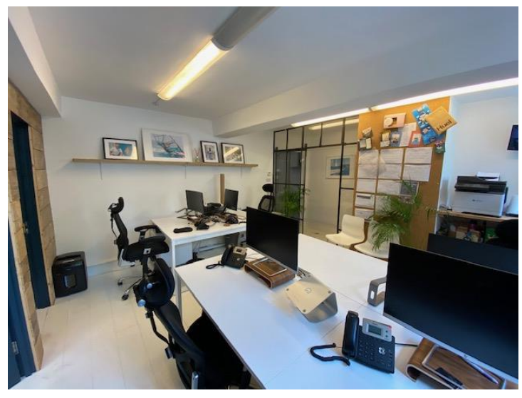
Unit 3 Office