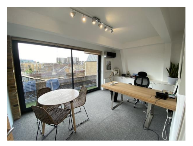
Unit 11 Office