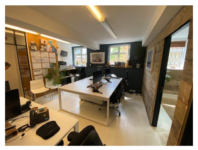
Unit 3 Office