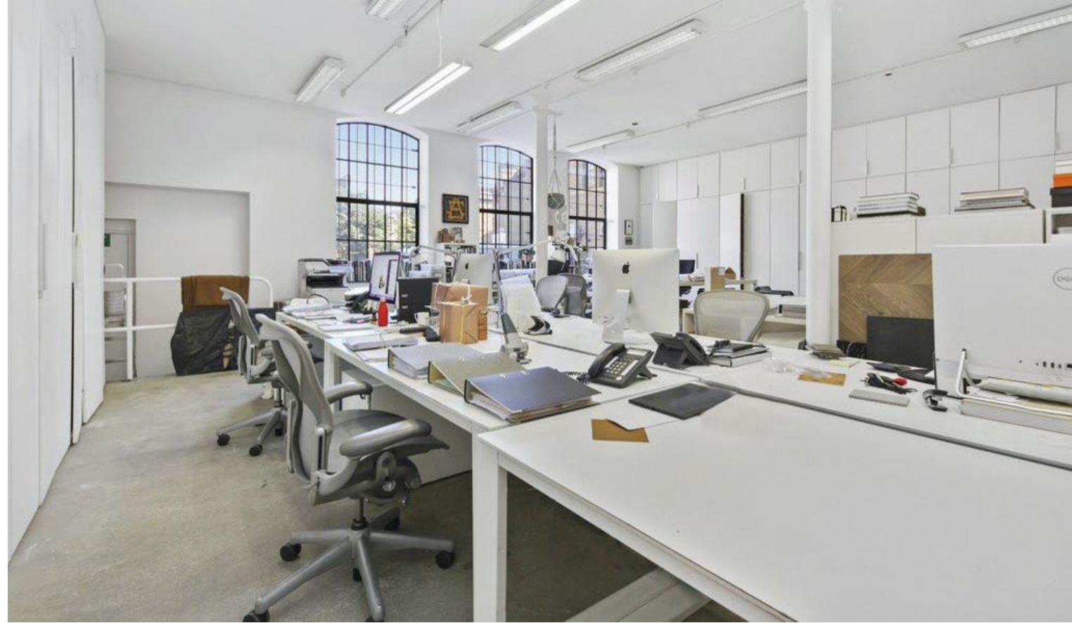
Previous tenants' fit-out