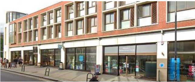
3. Le Pain Quotidien & Co-op