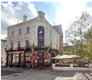
4. The Whie Horse