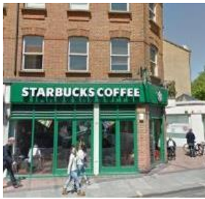
2. Starbucks & Parsons