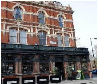
1. Duke on the Green