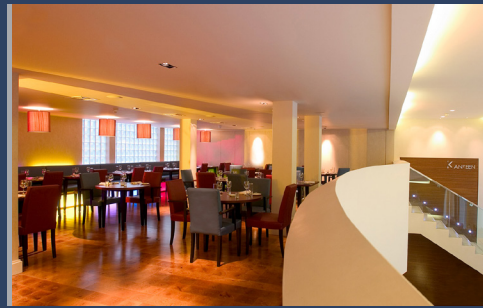
Studio Kitchen - K West Hotel