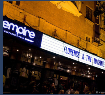
Shepherds Bush Eimpire