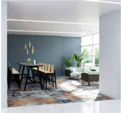
CGi 's of new reception