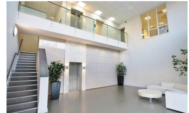
2 Station Court Foyer

Misrepresentation Act 1967: These particulars are believed to be correct but their accuracy is not guaranteed and they do not form part of any contract. Unless otherwise stated, all prices and rents are quoted exclusive of VAT Brochure September 2022