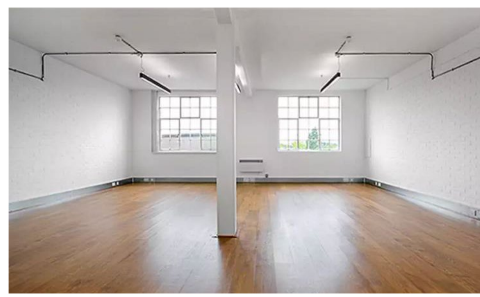
Similar indicative studio images