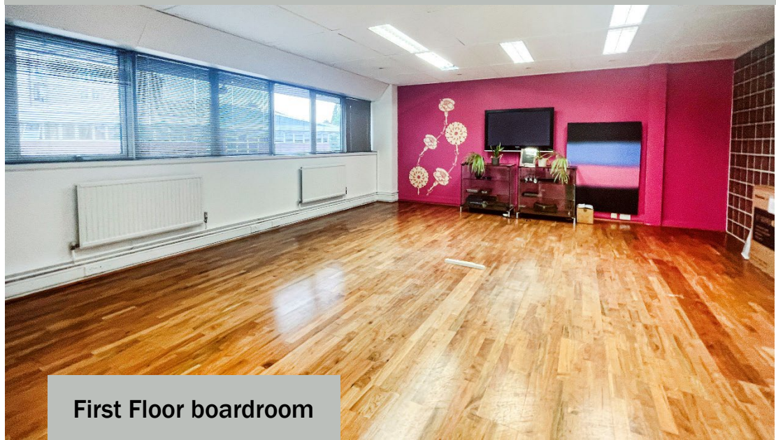
First Floor boardroom