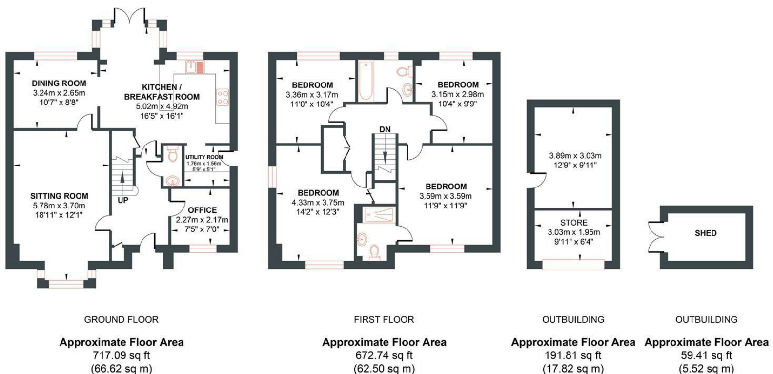
Illustration for identification purposed only, measurements are approximate, not to scale.

Foster & Co and their clients give notice that: These sales particulars do not constitute any part of an offer of contract and are for guidance for prospective purchases only and should be not relied upon as a statement of fact. We are not to be held responsible for material information that has not been given to us by our client at the time of marketing. All measurements are approximate