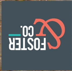
Roma Farm Cottage Wincham Lane Henfield, BN5 9AG