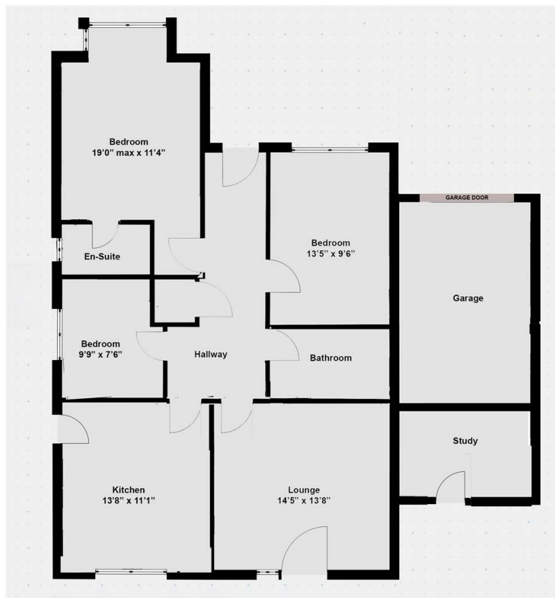
While every attempt has been made to ensure accuracy, all measurements are approximate, not to scale. This floorplan is for illustrative purposes only.