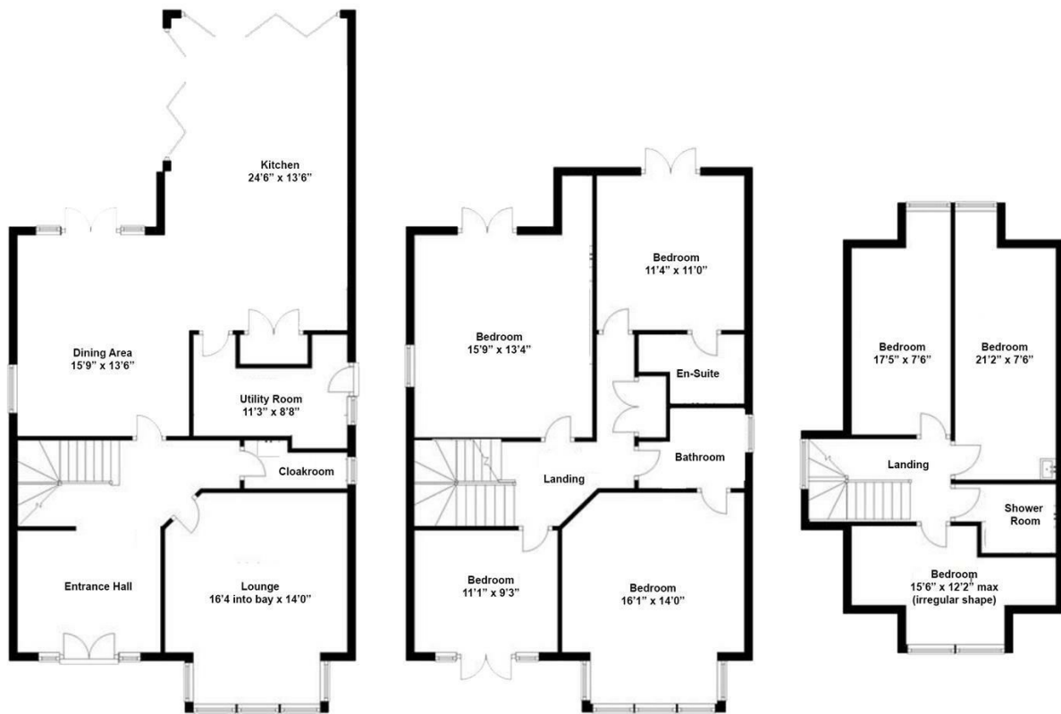
While every attempt has been made to ensure accuracy, all measurements are approximate, not to scale. This floorplan is for illustrative purposes only.