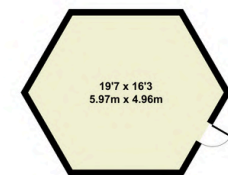
THE FOLLY FIRST FLOOR