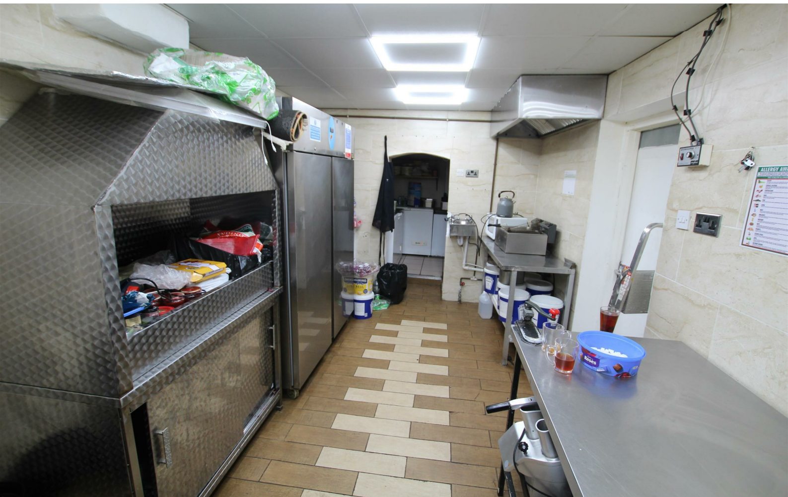
South View, Chester Le Street