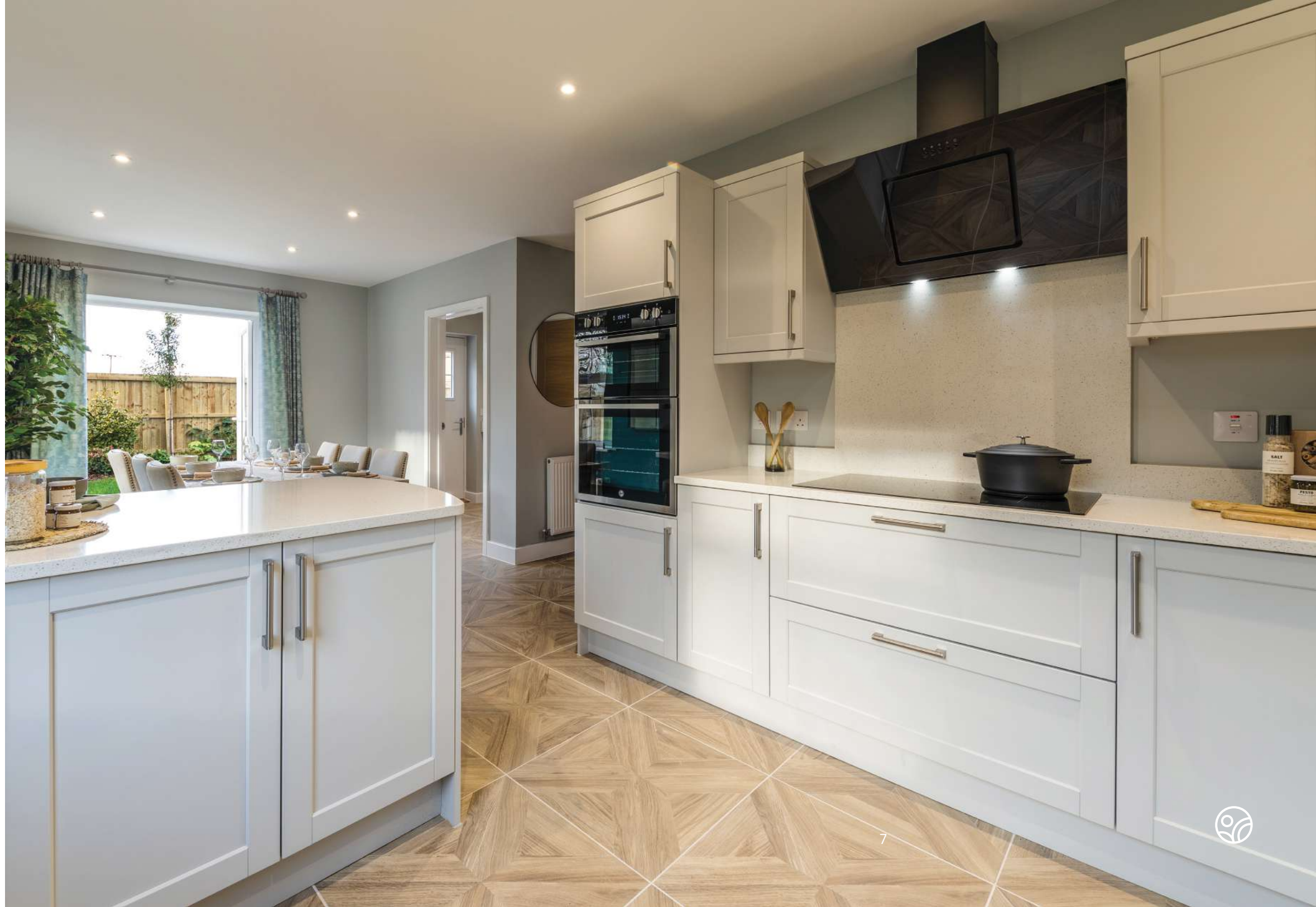
ABOVE & RIGHT Typical Devonshire Homes interiors — not site specific