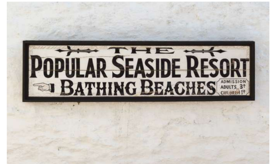
LEFT & ABOVE Toposcope at The Torrs & sign directing to Tunnels Beaches, popularised in the Victorian era

A large part of North Devon's coastline is a designated National Landscape to protect its diverse habitats and scenery, which ranges from rugged cliffs and sheltered coves to long stretches of dune-backed beaches.