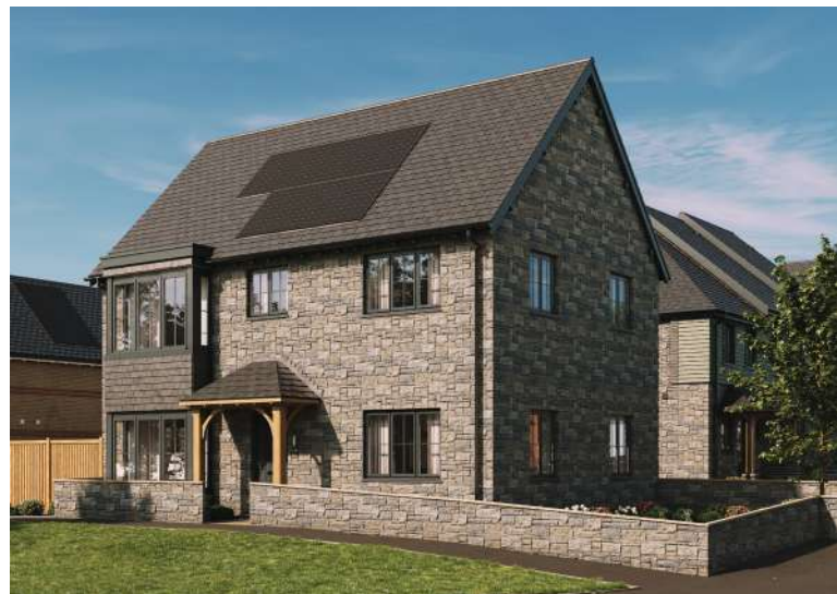
LEFT Bovey ABOVE Torrige

Mariner's Haven references the safe refuge that Ilfracombe's historically significant port provided for seafarers.