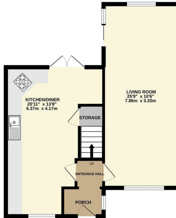
GROUND FLOOR 556 sq.ft. (51.7 sq.m.) approx.