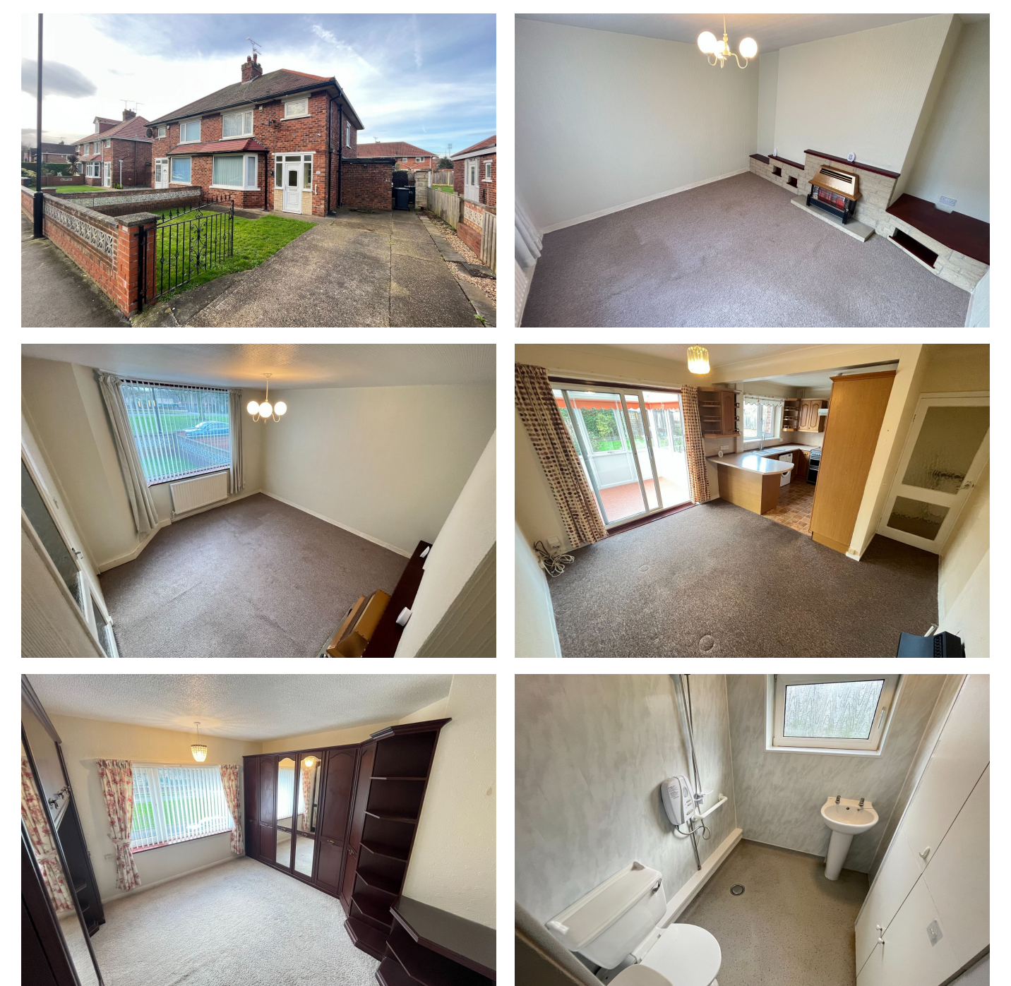
🛤 3 🚰 1 🚘 2

01302 981 149 info@elitepg.com // www.elitepg.com 3 Cavendish Court, South Parade, Doncaster DN1 2DJ