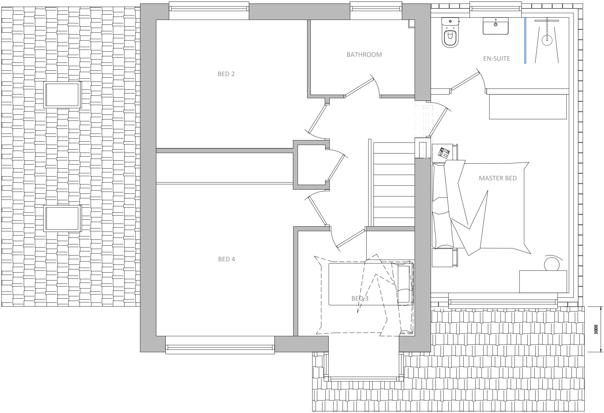
PROPOSED 1F PLAN 1:50 @ A1